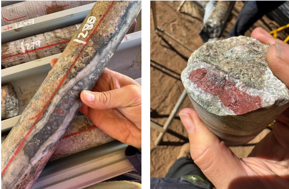
Figure 2 – Drill core from GN25-01, showing examples of some epithermal-style quartz veins and containing pyrite and hematite-stained fragments (left) and hematite-agate fill (right). Neither example shown here contains copper or zinc sulphides.

Hole number 2 at Grunter North intercepted significant widths of graphitic black shales and silicified metasediments. Disseminated pyrite associated with the graphitic shales may be a possible source of the chargeability anomaly.