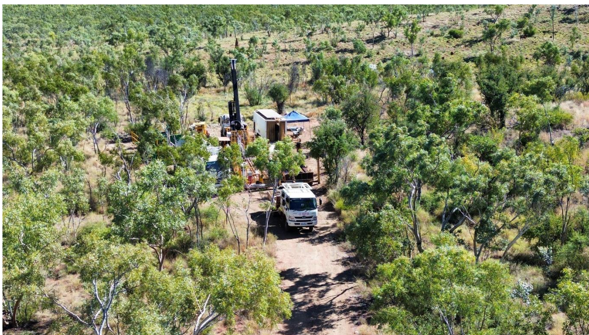
Figure 1 – Drill site set up at the Grunter North prospect

Rubix Resources Limited (ASX: RB6) is pleased to announce the recent completion of drilling at its Paperbark Project in northwest Queensland. Drilling at the project was designed to test the Grunter North chargeability anomaly, and a variation to the program also saw a test hole drilled into the JB Zone chargeability anomaly.