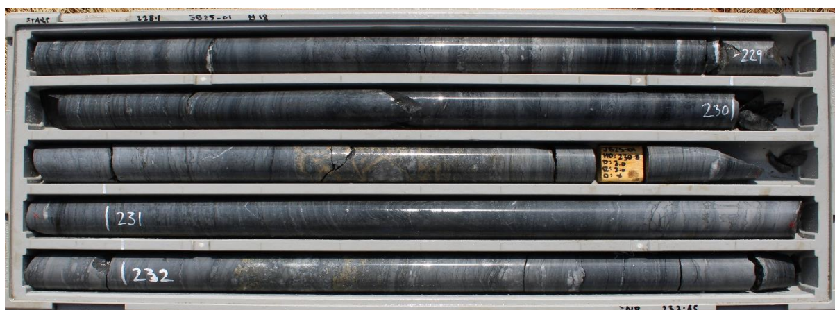
Figure 3 – Tray 18 from JB25-01, showing typical replacement style honey-coloured sphalerite mineralisation encountered downhole. Intervals from 230.3-230.6m and 232.1-232.4m each estimated to contain 5-10% sphalerite. Refer to table 2 for full list of visual estimates.

Cautionary Statement: Identification of sulphides, and reporting of visual results is not considered a proxy or substitute for laboratory analyses. The samples have been despatched for laboratory analysis and results will be reported upon their receipt in accordance with the Company's continuous disclosure policy..