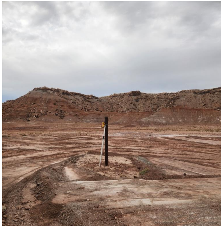
Figure 1 : Photo of Mt Fuel/Skyline Geyser Well Re-established Drill Pad

The well pad is located 4km east of the Green River and 12km south of the Bosydaba#1 well drilled by Anson in 2024, see ASX Announcement 22 April 2024 . , see Figure 1, along plateaus surrounded by canyons and ridges which are divided by ephemeral drainages that typically flow west towards the Green River.