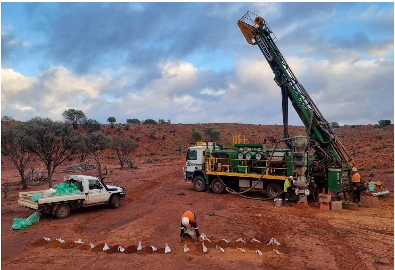
Figure 2: RC drilling at the Thornbill West Prospect