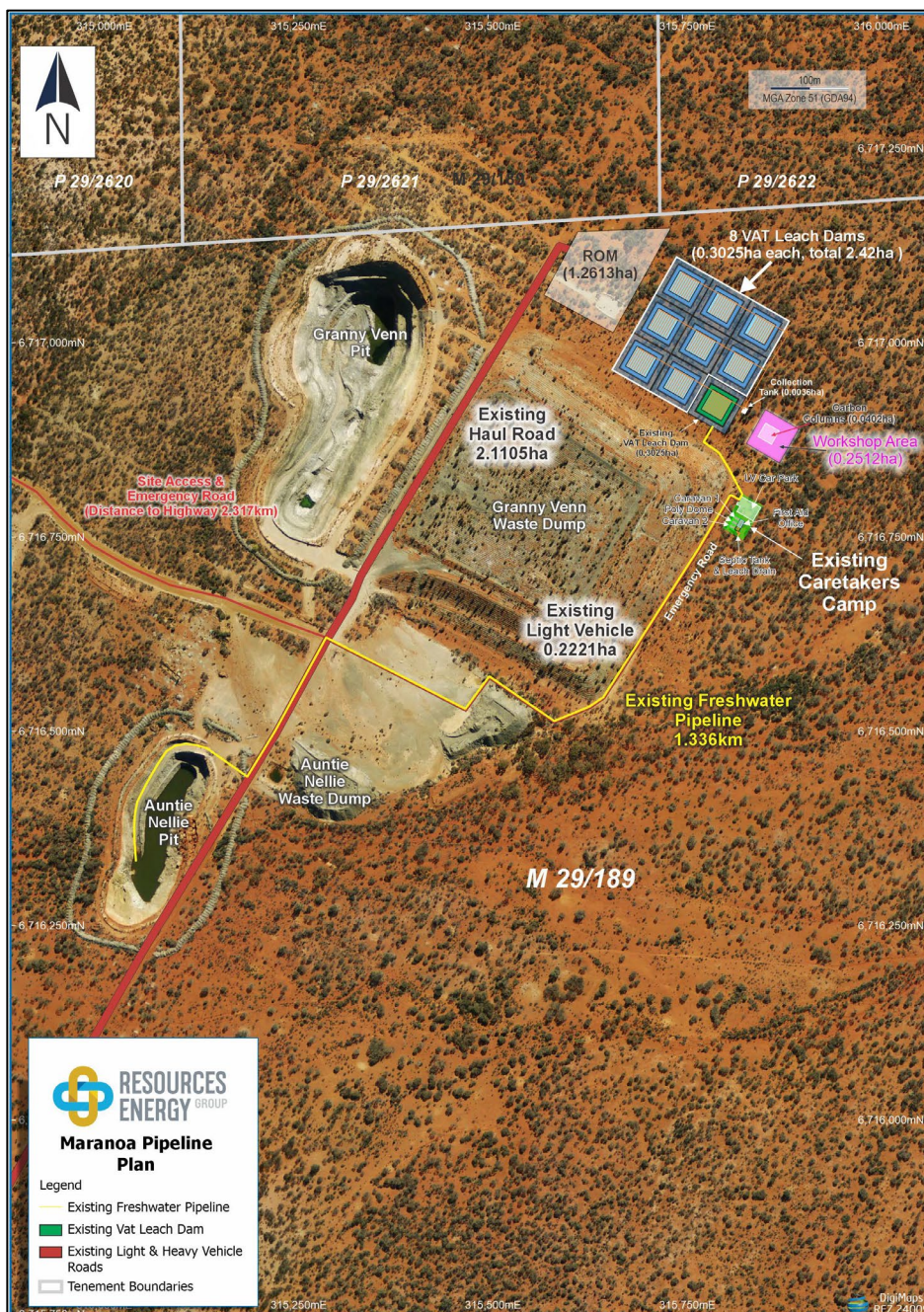
Figure 1: Maranoa Vat Leach Pipeline Plan