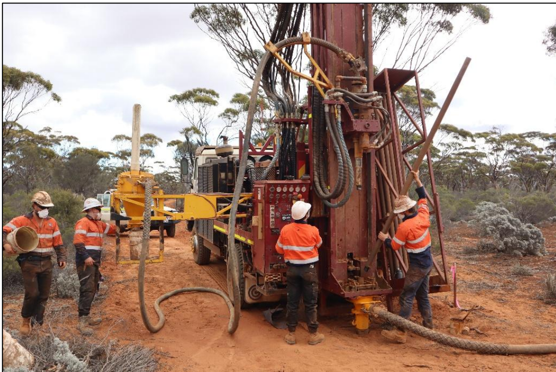
Figure 1: AC drilling (Gyro Drilling) has commenced at the Themis South Prospect

About 70 air core (AC) holes will be drilled for a planned metrage of 5,000m which is planned to test two gold prospects based on historical gold intersections.