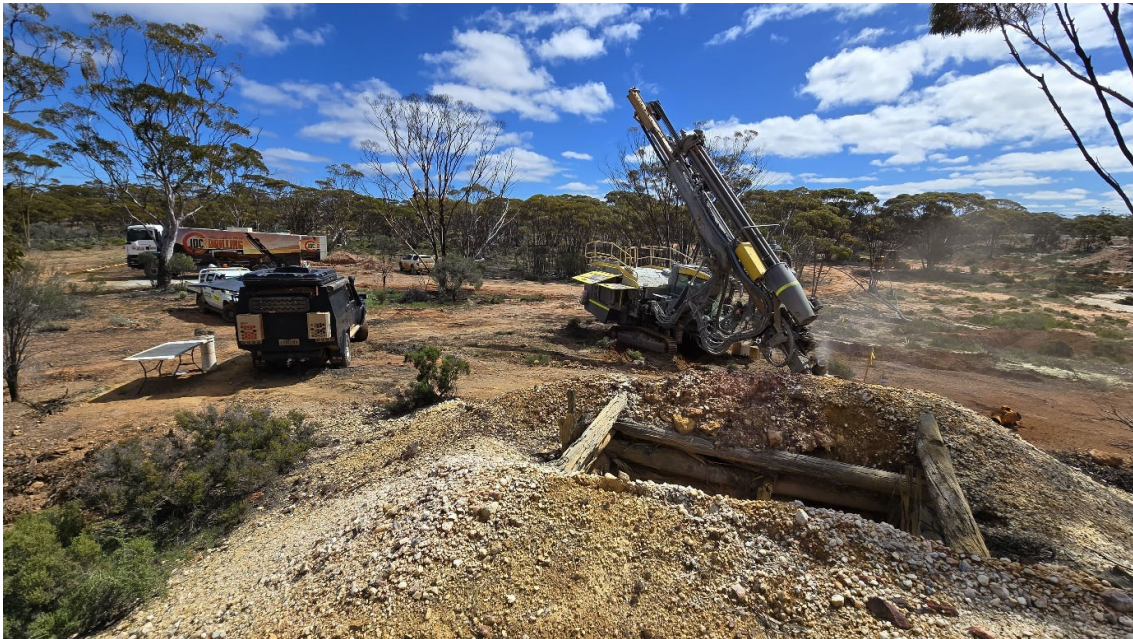
Figure 1: Track mounted RC drilling in progress at the Mt Palmer Gold Project.