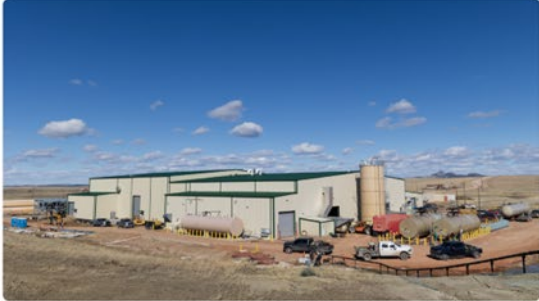
Central Processing Plant (Phase I & II)