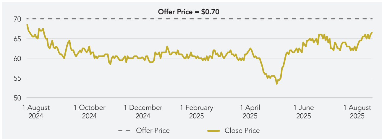
ECF trading performance relative to Offer Price (cents)

The Offer represents an attractive premium to ECF's NTA per security as at 30 June 2025 and trading levels as at the Announcement Date. The Offer Price is materially above where ECF has recently traded at, as demonstrated in the chart below.