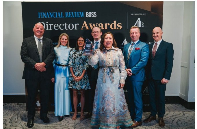
Australian Financial Review (AFR) BOSS Director Awards - June 2025