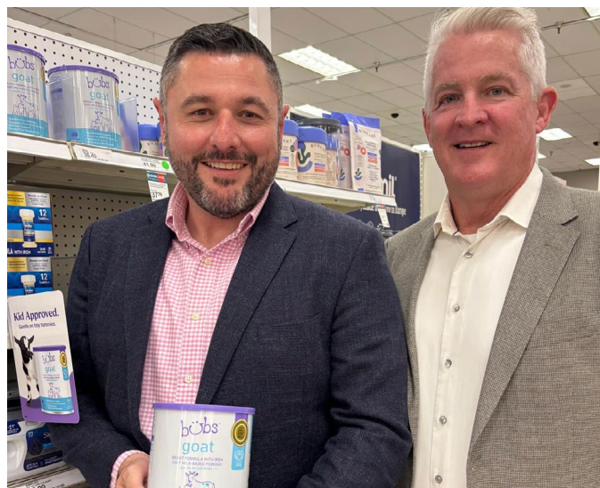
Target store - Los Angeles, USA