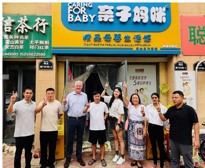
China O2O General Trade Store - August 2025