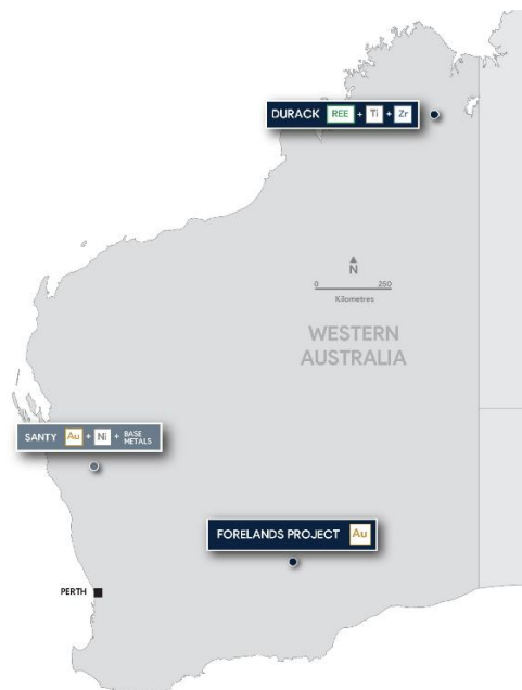
BPM Minerals Western Australian Projects

The management and exploration teams are well supported by an experienced Board of Directors who have a strong record of funding and undertaking exploration activities which have resulted in the discovery of globally significant deposits both locally and internationally.