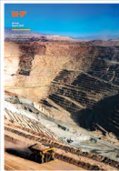
Annual Report 2025