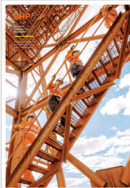
Economic Contribution Report 2025