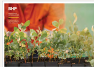
ESG Standards and Databook 2025