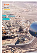
Modern Slavery Statement 2025