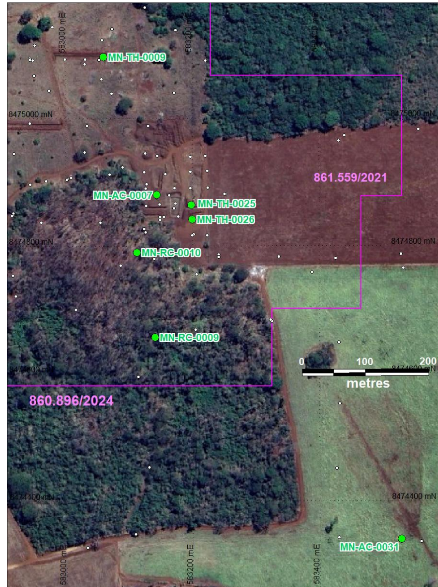
Location of EDEM drillholes with recent ALS pulp analyses.