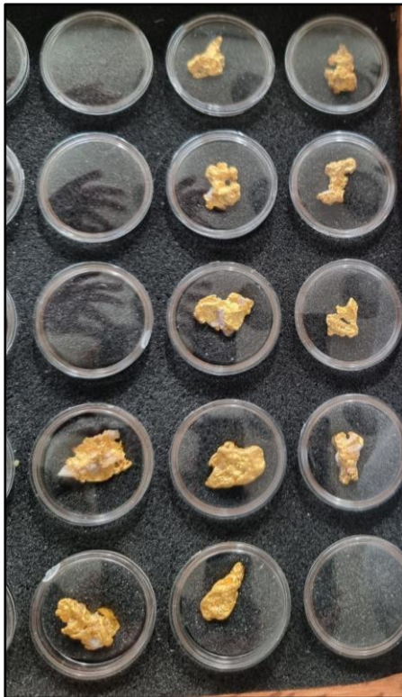
Picture 3. Selection of Great Western nuggets in 2cm diameter containers