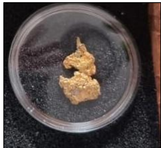
Picture 3. Angular nugget in a 2cm diameter container