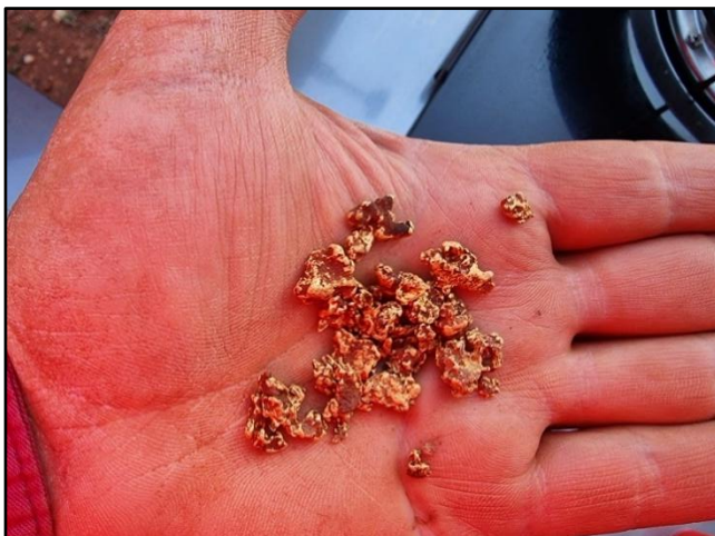
Picture 2. A number of nuggets collected at Great Western