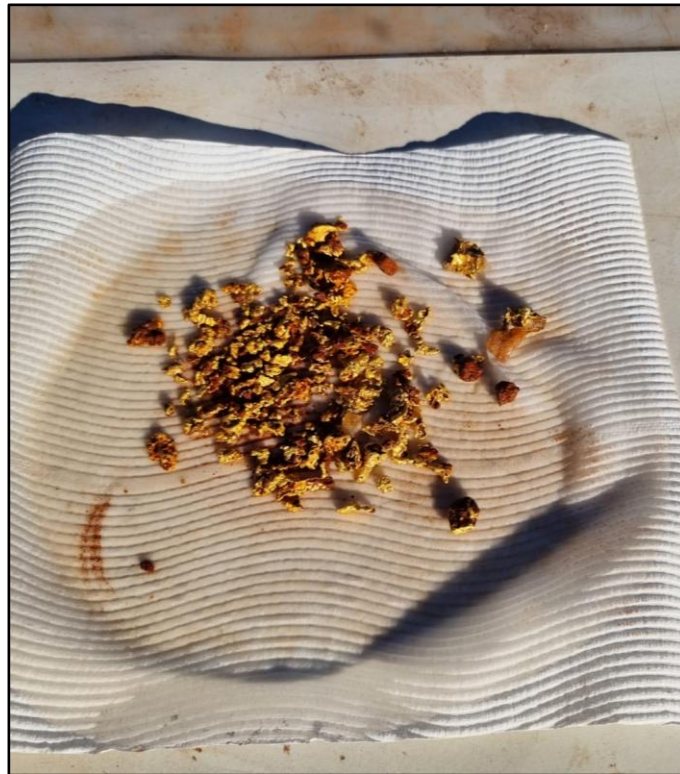
Picture 4. Nuggets as found in the field at Great Western