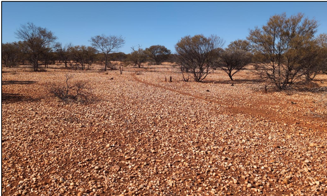
Picture 1. Abundant quartz and sheet wash material at the area where the nuggets were found.

Given the nuggets are located on the western margin of the modelled Great Western intrusive (see Figure 1 and refer to ASX announcement 9 th September 2025), it further enhances the geological model that this late intrusive has provided the structural deformation and setting for high grade gold mineralisation to occur along the splay corridor. Further surface geochemical sampling and prospecting will occur along the margins of this intrusive unit with the results released to the market in due course. Given that this entire trend has not been drilled to date, it provides not only a substantial opportunity along the Great Western splay, but across the wider project where these late intrusives (characterised by coincident Mo-Bi-Te-Cu) have been additionally identified.