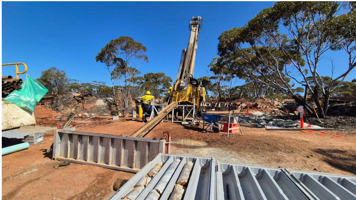
Figure 2: Diamond core drilling underway at the Mt Palmer Gold Project.