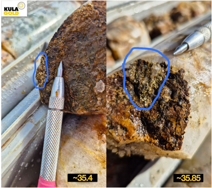
Figure 4: Visible Gold in Quartz Vein intersected at 35.4m (left) & 35.85m (right) down hole in 25MPDD001 within a broader 5m wide shear zone.