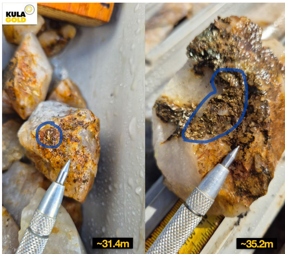
Figure 3: Visible Gold in Quartz Vein intersected at 31.4m (left) & 35.2 (right) down hole in 25MPDD001 within a broader 5m wide shear zone.