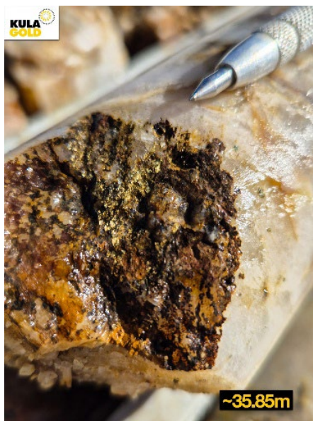
Figure 1: Visible Gold in Quartz Vein intersected at 35.85m down hole in 25MPDD001 within a broader 5m wide shear zone.

Kula’s Managing Director Ric Dawson said: “Whilst we cautiously await the assays from Diamond Hole 25MPDD001 we are pleased to report the strong visual indications of mineralisation at the Mt Palmer Gold Project. We look forward to further updating the market on the assay results and what the broader results are from the drilling programmes.”