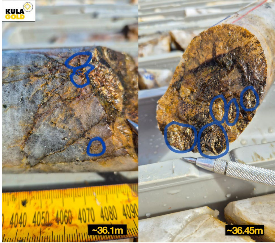
Figure 5: Visible Gold in Quartz Vein intersected at 36.1m (left) & 36.45m (right) down hole in 25MPDD001 within a broader 5m wide shear zone.