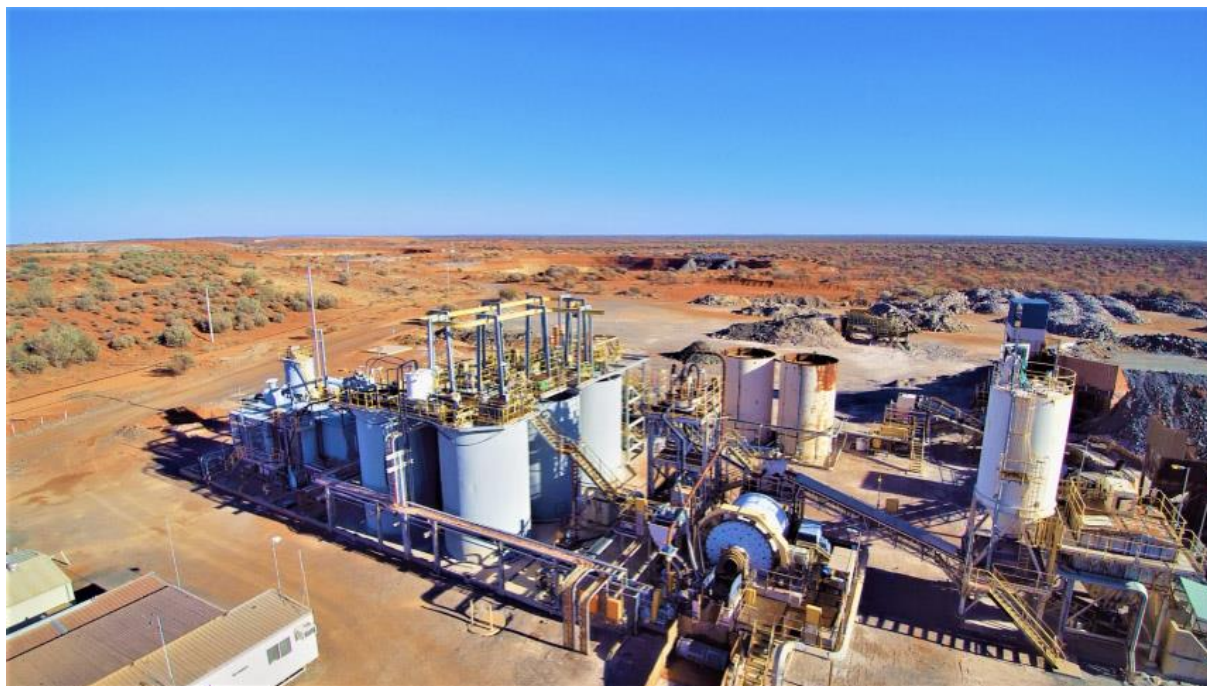
Figure 2 - Burnakura gold processing plant

During the financial year, the Company executed a Memorandum of Understanding for Mill Access and Collaboration ("MOU") with its Tuckanarra joint venture partner, Monument, to collaborate on studying options to process ore from Tuckanarra at Monument's nearby Burnakura gold processing plant.