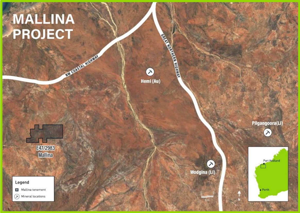
Figure 3: Mallina Lithium Project