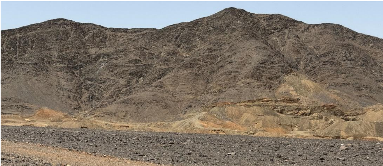
Figure 1: Photo taken by NME team on recent site visit showing workings along the base of a mountain extending over 800m of strike.

Similarly, exploration around North Hennai has not been systematic. An on-site due diligence exercise conducted in recent weeks by NME has identified potential targets for near-term expedited exploration activities, including costeaning and drilling. Once collected, samples are expected to be sent to facilities in Saudi Arabia or Romania for analysis. There is no historical exploration data reportable to JORC (2012) standards.