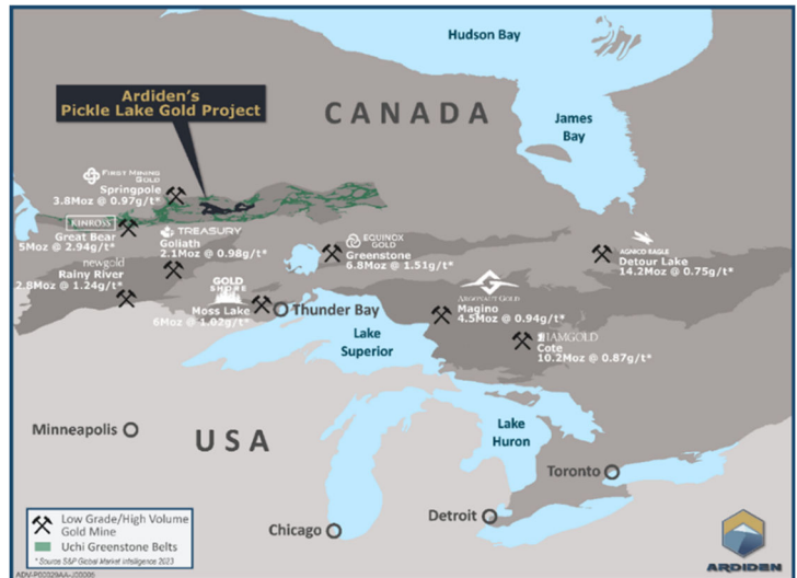
Figure 1 – Location of Arviden's Pickle Lake Gold project within the Uchi Belt of northwest Ontario 1 .

The Pickle Lake Gold Project is a District-Scale landholding, located east of Red Lake in the well-endowed Uchi Geological sub-province of north-western Ontario, Canada (Figure 1). The Uchi Province is host to numerous producing gold mines at Red Lake and at Musselwhite, and is a highly active exploration area with Evolution, Newmont, Kinross, and other development and exploration companies all actively pursuing gold exploration work in the area. There are three existing gold deposits (Kasagiminnis, Dorothy and Dobie) and several other identified brownfield and greenfield gold prospects over a 100km wide belt (Figure 2).