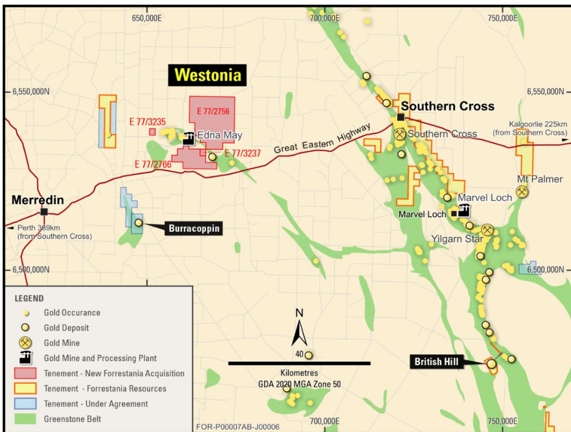
Figure 1: Tenure map south of Southern Cross

The Southern Cross Project is in the Southern Cross Greenstone Belt and has significant potential for gold mineralisation.