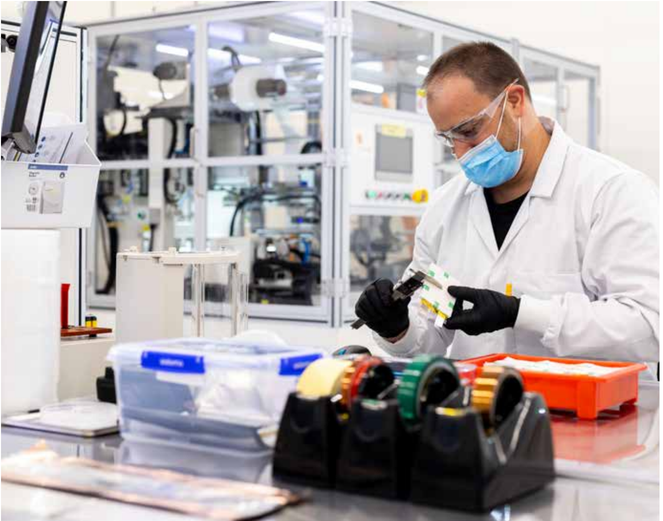
Quality Control is a key part of cell production

We believe that these four priorities will position us for long-term sustainable growth and the creation of shareholder value.