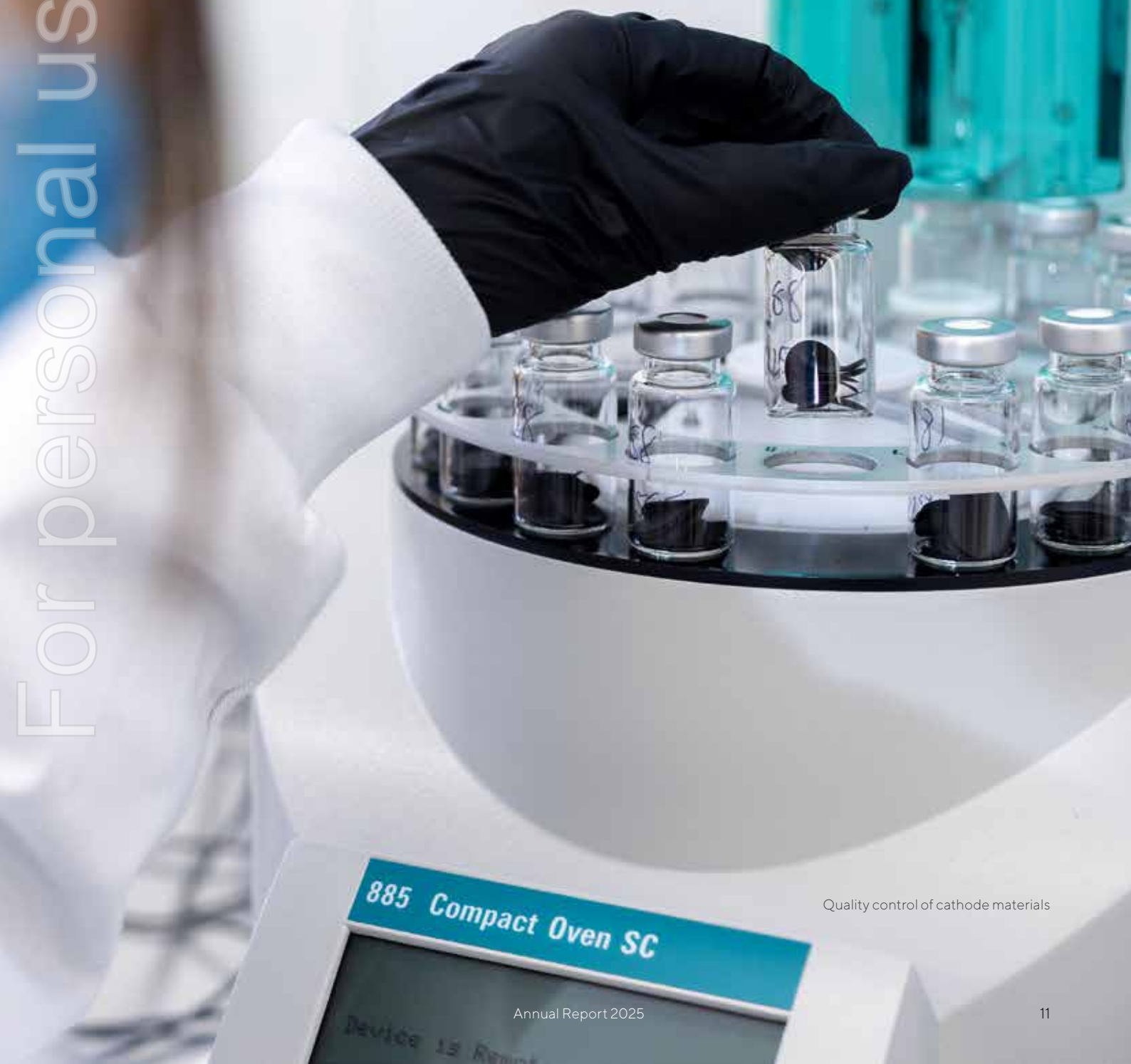
Quality control of cathode materials