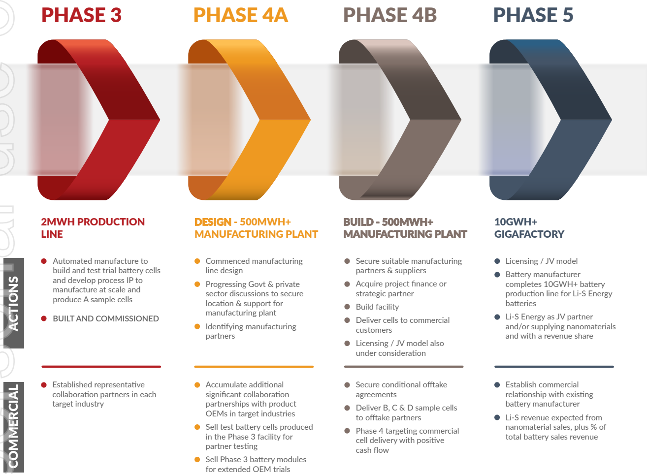
Diagram 1: Phases 3 to 5 of the Company's scale-up process

Through FY25 the Company has engaged extensively with its key target markets in Drones, Defence and eAviation, building a pipeline of partner and potential customer opportunities. With Phase 3 able to produce cells for testing and trials, this enables partners and potential customers to independently assess our performance advantages, specifically our energy density, safety and weight benefits, and to inform their procurement pathways.