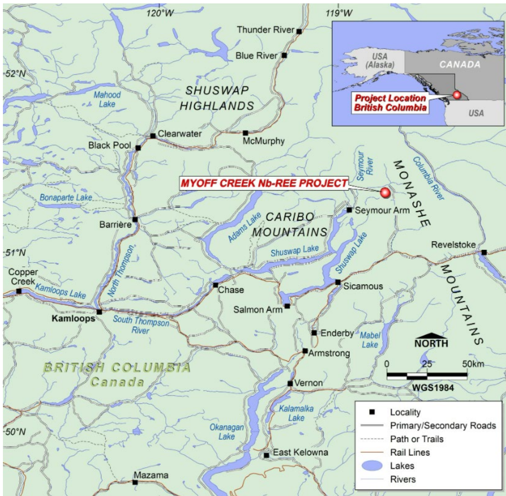
Figure 1 – Myoff Creek Project location

The nearest township of Seymour Arm, which is accessible by road from the claims, has accommodation and logistical support. Kamloops (population 108,000), the major commercial centre for the region, has numerous resources such as equipment and professional services for mining and exploration activities.