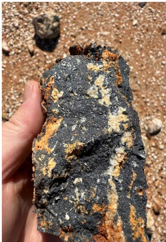
Figure 2 – Gallium mineralisation within hard pisolitic agglomerate yielding 1.68% Co from sample 30017