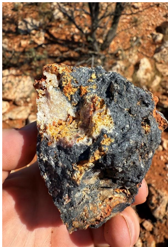
Figure 3 – Gallium mineralisation within hard pisolitic agglomerate yielding 1.12% Co from sample 30022