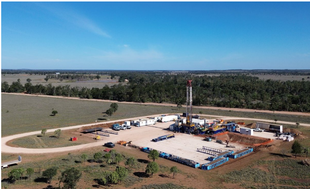
Figure 1: Diona-1 well pad

The weather looks clear for the coming week so we are not expecting any delays due to weather. All going to plan, the well will take 7-8 days to get to the top of the Showgrounds formation, our primary target (2,300m). The plan is to drill down through the Showgrounds and run wireline logs to assess the prospectivity of the formation. If the Showgrounds formation proves to be prospective for hydrocarbons, the well will be cased and then drilling will continue through the lower Tinowon and Wallabella formations to a total depth of 2,600m.