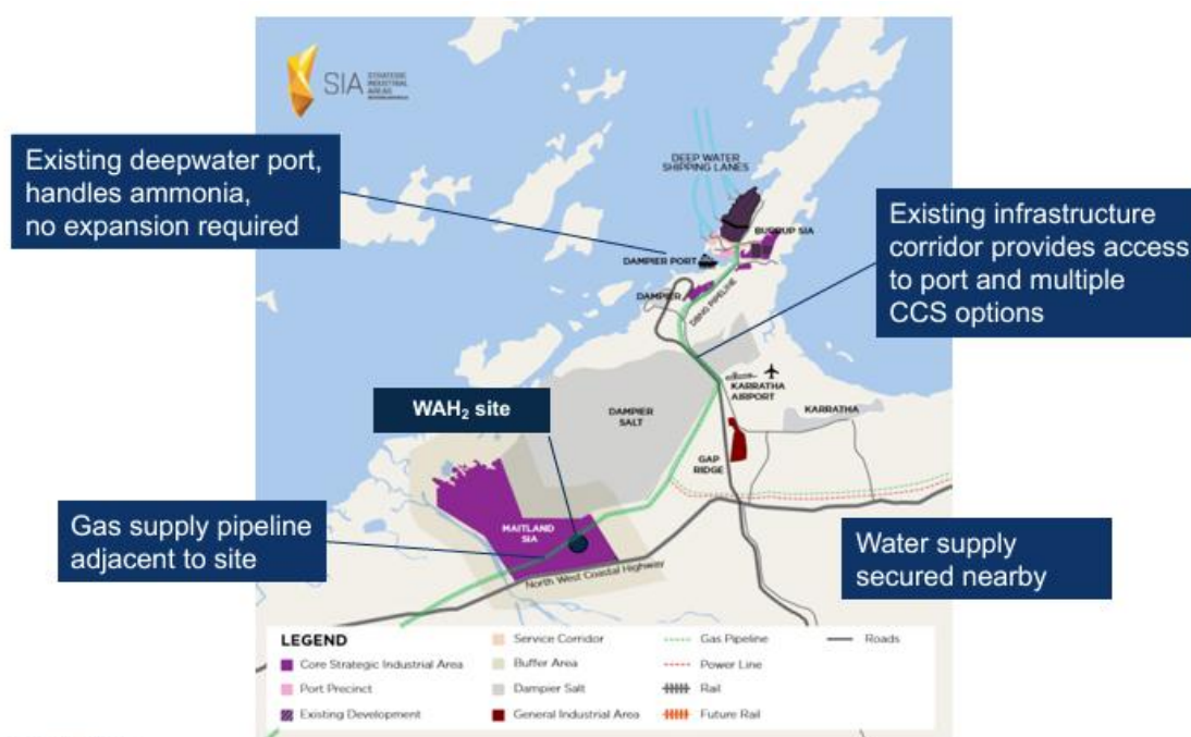
Figure 1: Location of WAH 2 Project

The Company and has executed a Key Terms Agreement for an Option to Lease and Lease with DevelopmentWA 10 . The Option to Lease has been agreed in-principle with final approvals pending document finalisation.