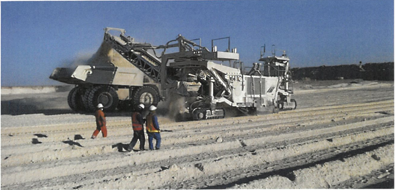
Fig 3 - Example Surface Miner – Limestone row cutting

Soalara's JORC resource is a near horizontal elevated sequence of Limestones forming a coastal escarpment. The shallow nature of the asset, with only ~1.5m of overburden, allows a very low stripping ratio for highly cost-effective open pit mining (Fig 3).