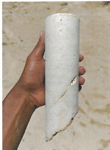
Fig 2 – High purity Soalara Limestone core

Consequently, an experienced 3 rd party based in Madagascar was commissioned to identify prospective mining and offtake partners interested in developing the project through a JV agreement with Cassius.