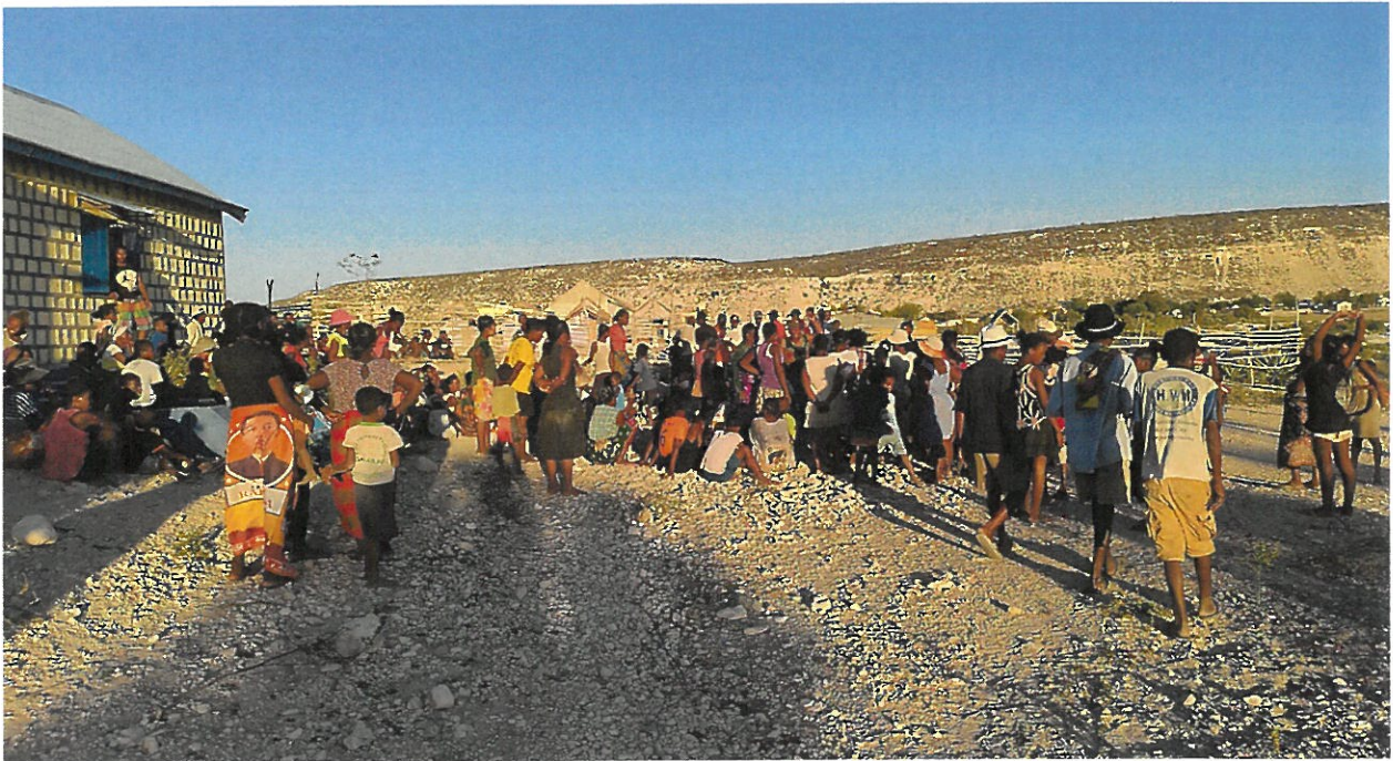
Fig 4 – Soalara Limestone Escarpment (from adjacent coastal township)

The Project's absolute coastal location directly adjacent to Soalara township (Fig 4), with close proximity to Toliara port and the national road network (Fig 5) supports cost effective logistics options for a future mining operation to transport high purity Limestone to domestic or international markets, including to existing cement production facilities in the Soalara region.