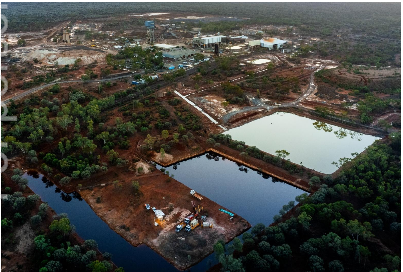
Figure 1. Endeavor Silver Zinc Mine – May 2025.

The production of silver-lead and zinc concentrates in June formally marked the restart of the operation. Export logistics were finalised in parallel with operational ramp-up, with zinc concentrates to be shipped in 10,000-dmt parcels and silver-lead initially in 5,000-dmt parcels through Berth 29 in Adelaide. These arrangements underpin the delivery of first revenues and provide certainty in concentrate handling for the ramp-up period.