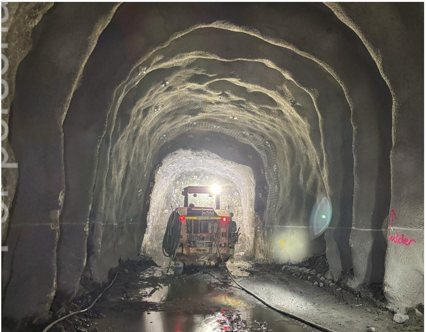
Figure 4. Upper North Lode high grade silver 10100 development drive.

Processing commenced on 7 June 2025 which quickly identified various plant items requiring further attention. Following the replacement of the ball-mill motor, the plant treated 36,066t during the month of June, demonstrating the robustness of the refurbished plant. The ramp-up plan anticipates maximum monthly throughput of 65,000 tonnes toward the end of calendar 2025, supported by the sequencing of ore from both the main lode and the Upper North Lode (UNL). However, blending of high grade UNL ore may require lower mill throughput to ensure maximum metal recovery to concentrate is achieved.