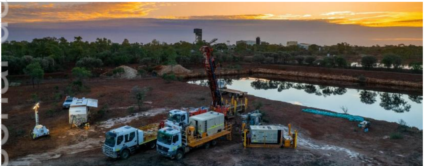
Figure 5. Drilling of Endeavor South – May 2025.

At Endeavor South, step-out drilling beneath silicified zones intersected alteration, visible sulphides and veining, together with elevated copper values. These results reinforce the potential for a southern extension to the Endeavor mineral system. Follow-up drilling is now underway, building confidence in the geological model and advancing the project toward more targeted step-outs.