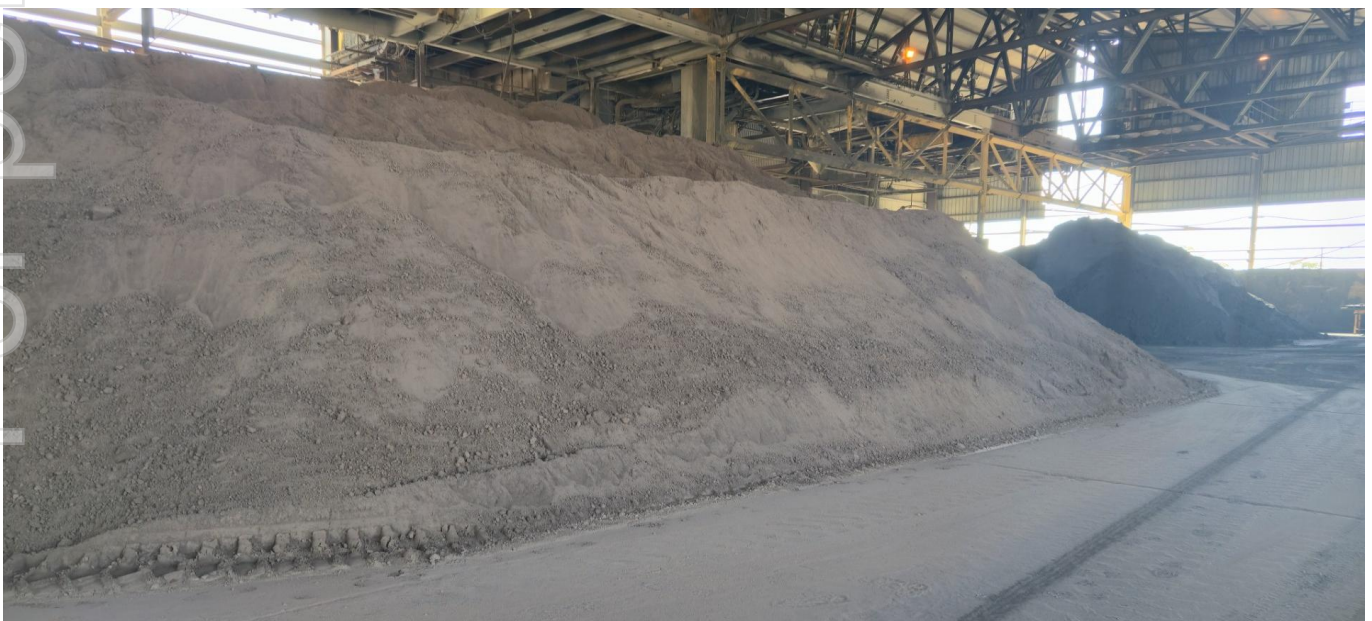
Figure 3. August zinc concentrate stockpile.

Subsequent to the end of the financial year, Polymetals announced that July 2025 concentrate production totalled 5,398t. Concentrate pre-payments of A$11.6 million were received, ensuring that