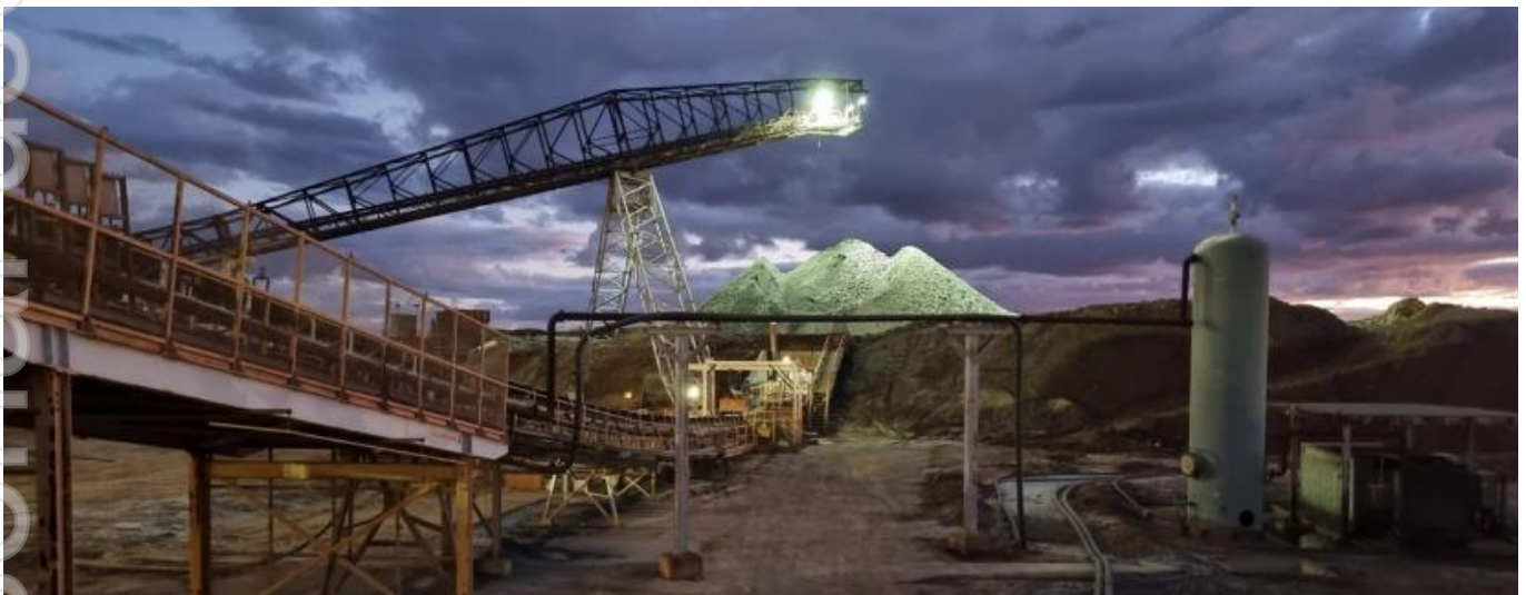
Figure 2. Crushed ore surface stockpile.

Workforce growth and transition was another feature of the year. At 30 June 2025, Endeavor employed 185 full-time staff, with contractor numbers significantly reduced following completion of refurbishment. This marked an important shift towards an autonomous, owner-operator mining model that will underpin sustainable production. Recruitment and training efforts are continuing, with the workforce expected to grow toward a steady-state complement of approximately 230 employees.