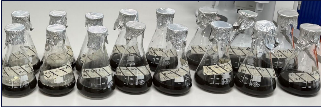
Photo 1. Bioleaching flasks with Brumby HEBS material mixed in various substrates and microbe content to identify the most effective conditions and temperature for leaching.

Shake flask experiments were conducted at eight different conditions with additional duplicate flasks to evaluate the effects of microbial seeding, substrate adjustments and incubation temperatures to maximise target element recovery.