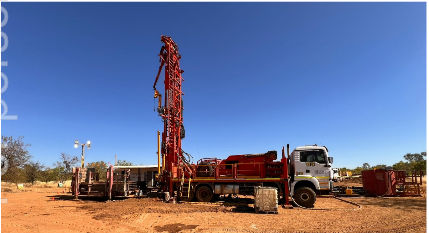
Figure 1: Drill rig onsite testing the Nardoo East (N8) target at Isa North

Strategic Energy Resources Limited (“ SER ” or “the Company ”) is pleased to announce the commencement of a 1,500m diamond drill program at the Isa North Project in northwest Queensland. The Project is currently surrounded by major mining companies including Fortescue, Anglo American and Rio Tinto (Fig. 2), and captures the projected northern extension of the mineralised Mt Gordon – Gunpowder Fault Zone. The Fault Zone is host to multiple large mineral deposits which lie on, or are adjacent to the fault system, including the Mt. Isa, Mt. Oxide and Gunpowder Copper deposits. Nearby drill results from True North Copper 1 (ASX: TNC) have recently demonstrated the fertility of the fault to host significant mineralisation further under cover.