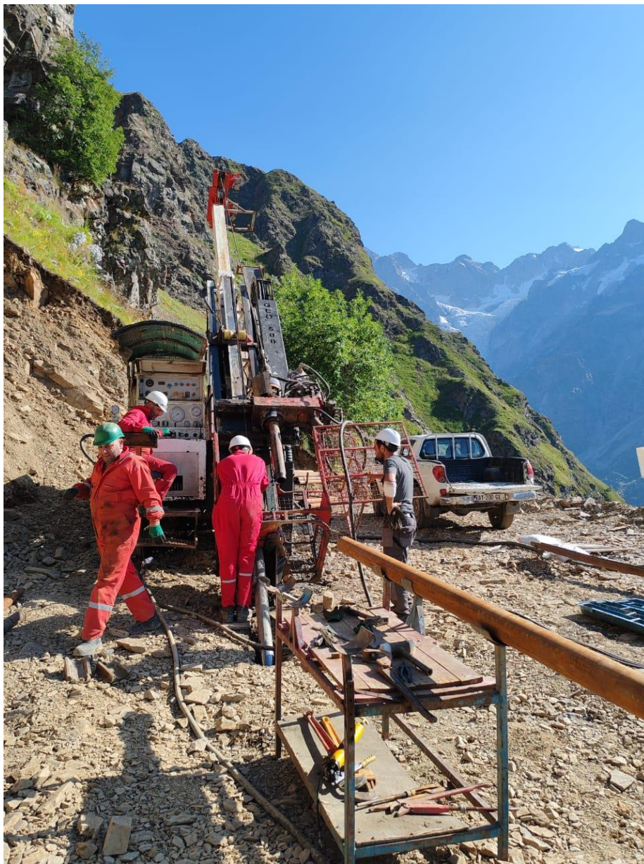
Figure 1: Photograph showing the initial drillhole at Zopkhito.

The Company has an initial 12 months, with the ability for one additional 12 month extension at the Company's election to complete the option. If the Company exercises the Option, the Company's Project Interest will be acquired through shares in an incorporated joint venture vehicle ("IJV"), to be established. The consideration for the Option and Project Interest is comprised of payments US$100,000 for the initial option fee (initial 12-month option period and an additional US$100,000 for the extension of the option period (for an additional 12 months – total of 24 months under option). At any time in the option period the Company can acquire an 80% Project Interest by payment of US$7,000,000 ("Acquisition Consideration"). Subject to prior approval from the Company's shareholders, the vendor may elect to take 50% of the acquisition consideration in fully paid ordinary shares in the Company at a deemed price of A$0.01. The maximum number of Company shares that may be issued for 50% of the Acquisition Consideration is 532 m shares.