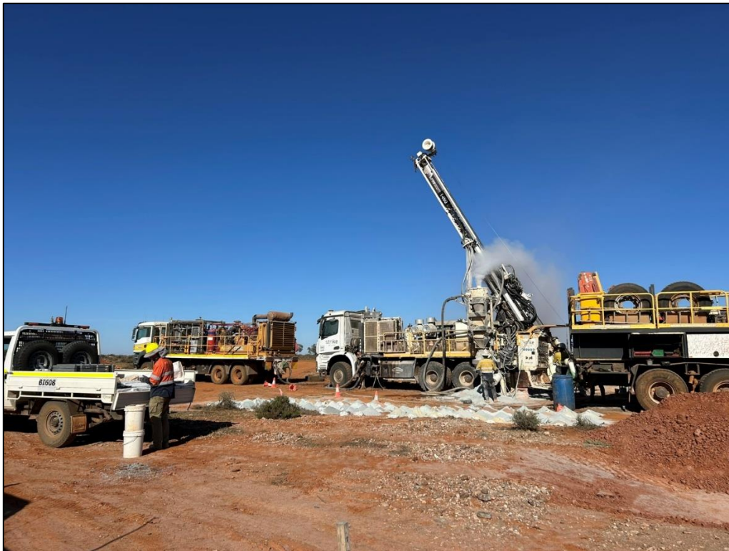
Figure 2: RC Drill Rig on Site at Killarney Project