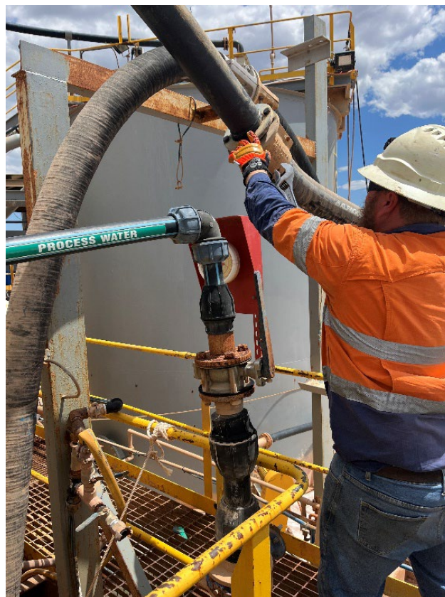
Figure 3: Last of the repairs on the Cyclone feed line.