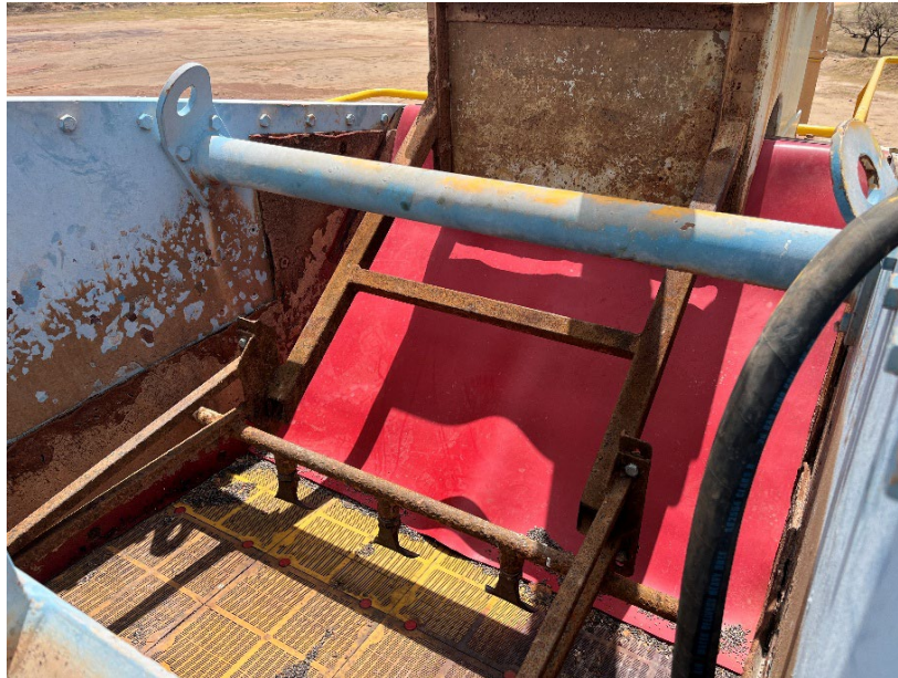
Figure 4: New Linatex installed on the Trash screen on top of Tank 1