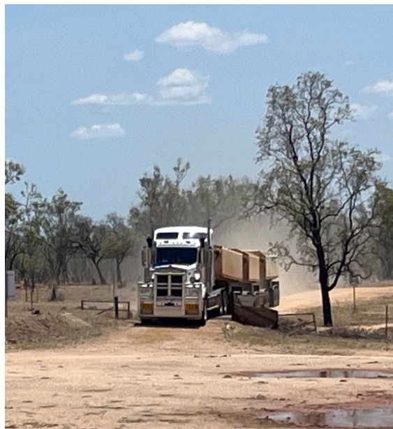
Figure 5: Crushed feed arriving at GGPP from Charters Towers

Road train haulage of approximately 950 tonnes of crushed gold bearing material from Charters Towers to the Georgetown Run of Mine (ROM) pad resumed on 21 September (Figure 5). The transport of this material to GGPP is expected to be completed during the first week of October.