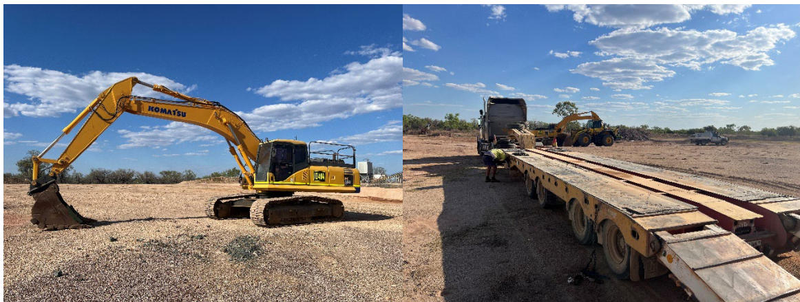
Figure 6: First of the mobile fleet arriving on site.

The GGPP relies on mobile crushers reducing ROM feed to less than 8 mm sized particles to be fed into the ball mills. The crushing contractor for this gold production campaign has been selected and has commenced mobilisation to site on 29 September (Figure 6). The Crushing contractor is expected to complete mobilisation during the first week of October.