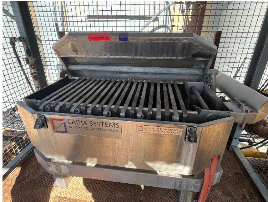
Figure 2: Refurbished Electro-winning Cell