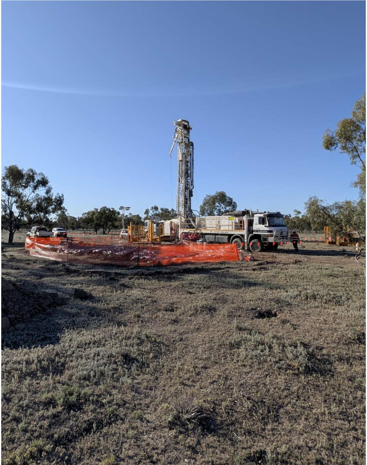
Figure 2. Diamond rig preparing to start hole SWAD0001 on Anomaly 1 beneath the black soil plains of the upper Darling River.

Broken Hill (NBH) in the 1980's, very few of these penetrated the cover and reached basement, so the area is effectively unexplored.