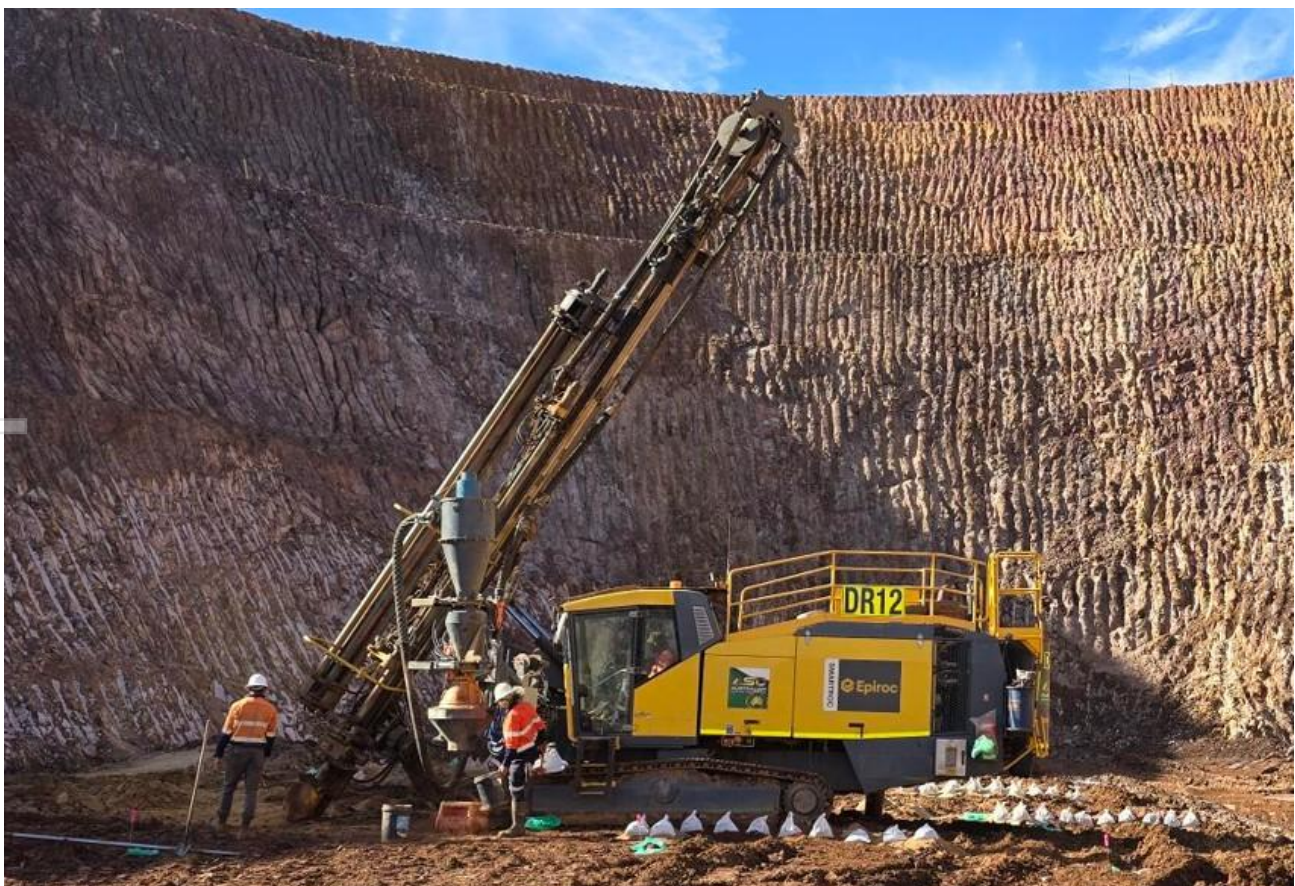
Figure 1: Type of grade control drill rig booked.