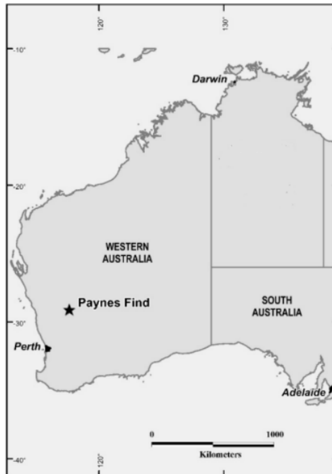
Figure 1 - Paynes Find Gold Project location

The AC drilling program is expected to take approximately one week to complete. Analytical results are expected to be reported late in the December Quarter.