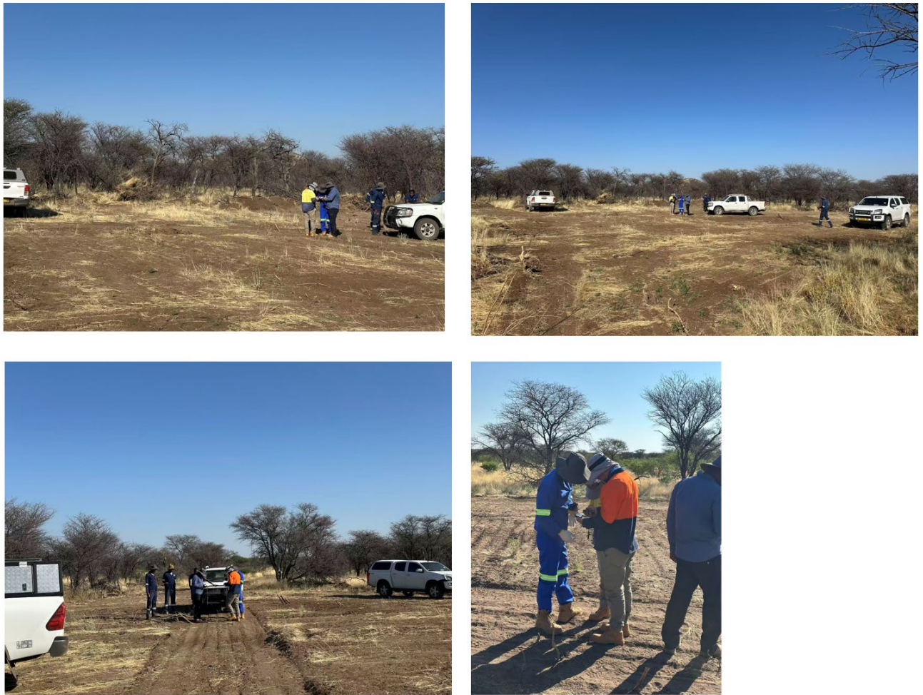
Figure 2: Survey crew on site at Omuronga where the ground magnetic survey has commenced.

Collectively, these geological and geophysical datasets point to a concealed intrusive with carbonatite affinity, providing a strong basis for drilling.