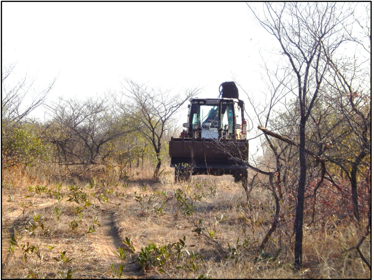
Figure 4 - Typical vegetation in the area.

This announcement has been authorised for release by the Board of Belarox.