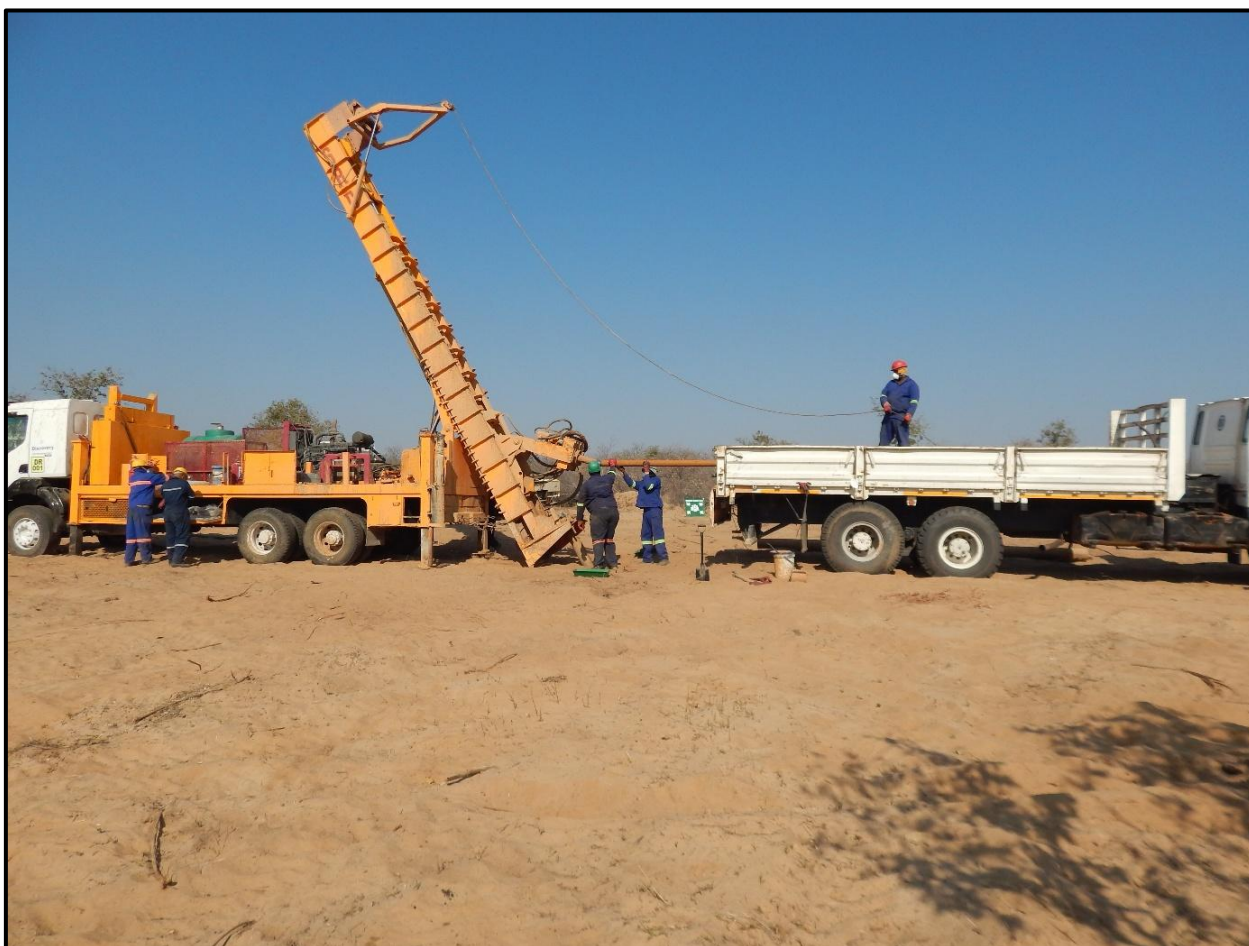
Figure 1 - RC Rig 01 at drillhole BRX0085-007