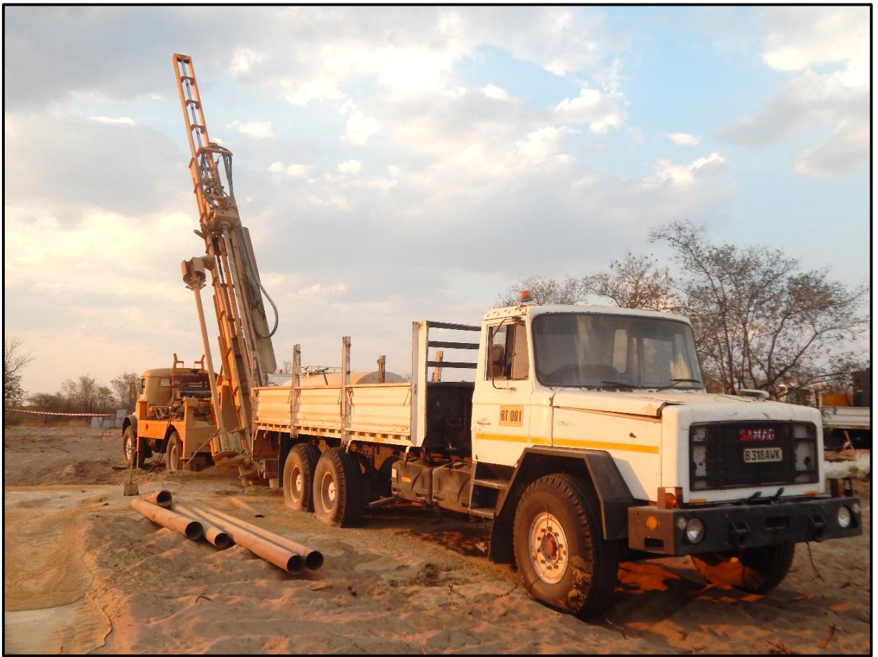
Figure 2 - RC rig 2 at drillhole BRX0085-008.