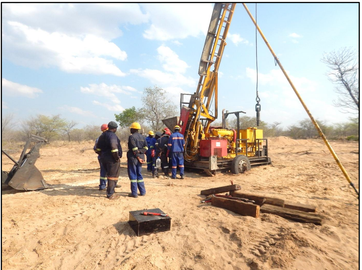
Figure 3 - Setup of the diamond drill rig at BRX0085-006.