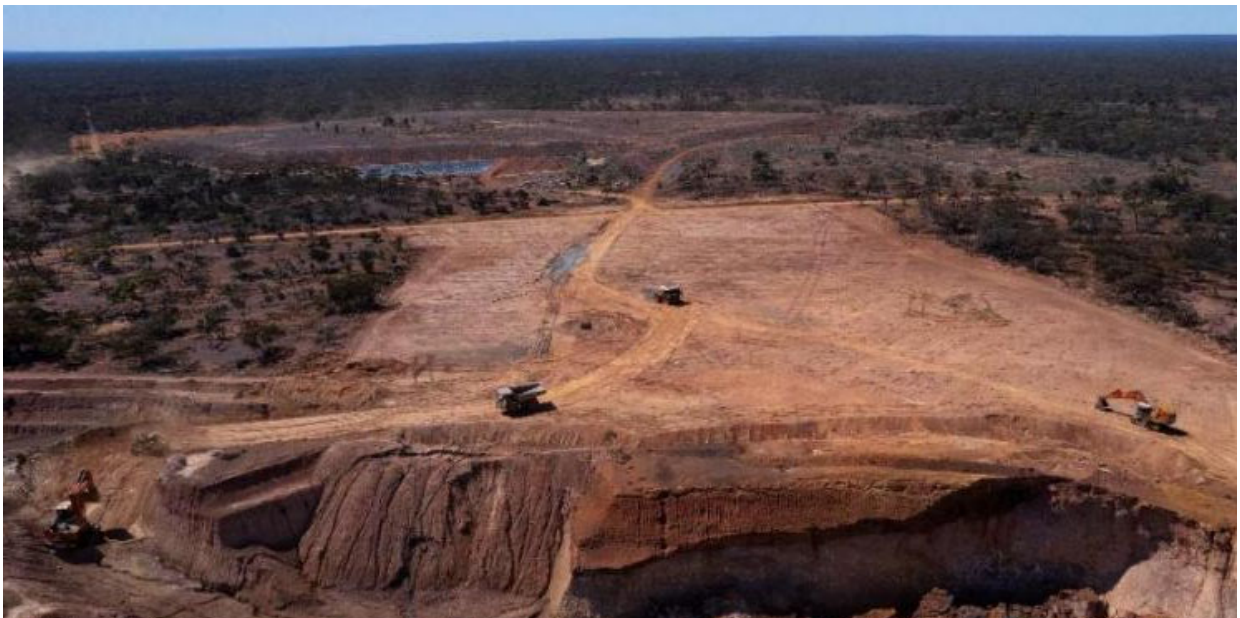
Figure 1: Mining is underway at Fingals open pit.

Black Cat’s Managing Director, Gareth Solly, said: “The commencement of mining at Fingals follows the recent start of mining at the nearby Majestic underground. Once both mines are ramped up, they will supply 100% of the feed to Lakewood for years to come. Importantly, both deposits remain open with drilling planned to continue growing Resources and Reserves. In addition, the planned shutdown at Lakewood for the installation of a new gravity tower, was completed safely and to plan despite a number of weather events. This marks another key step in our ‘More Gold, Sooner’ strategy.”