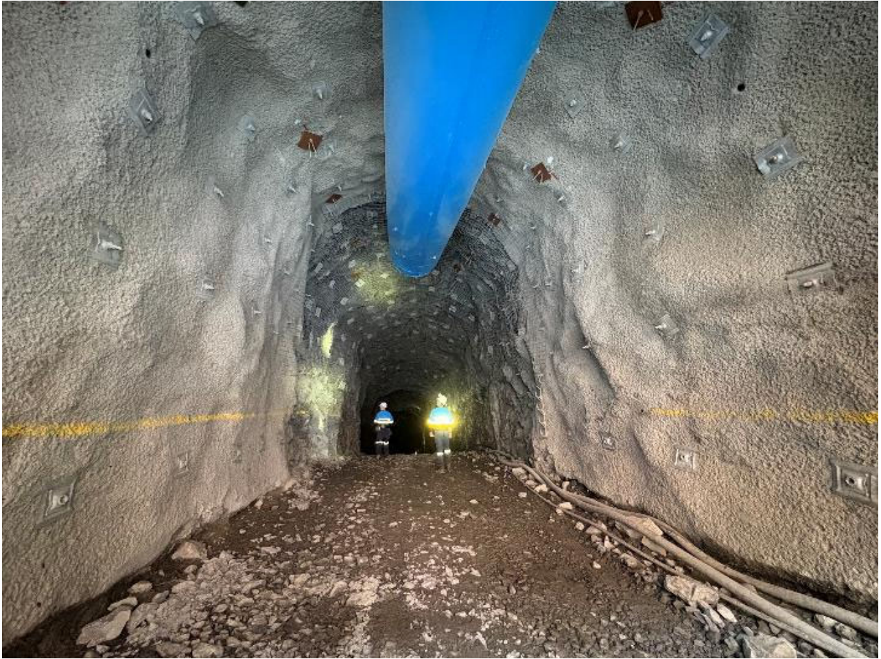
Figure 2: Decline development at Majestic underground.