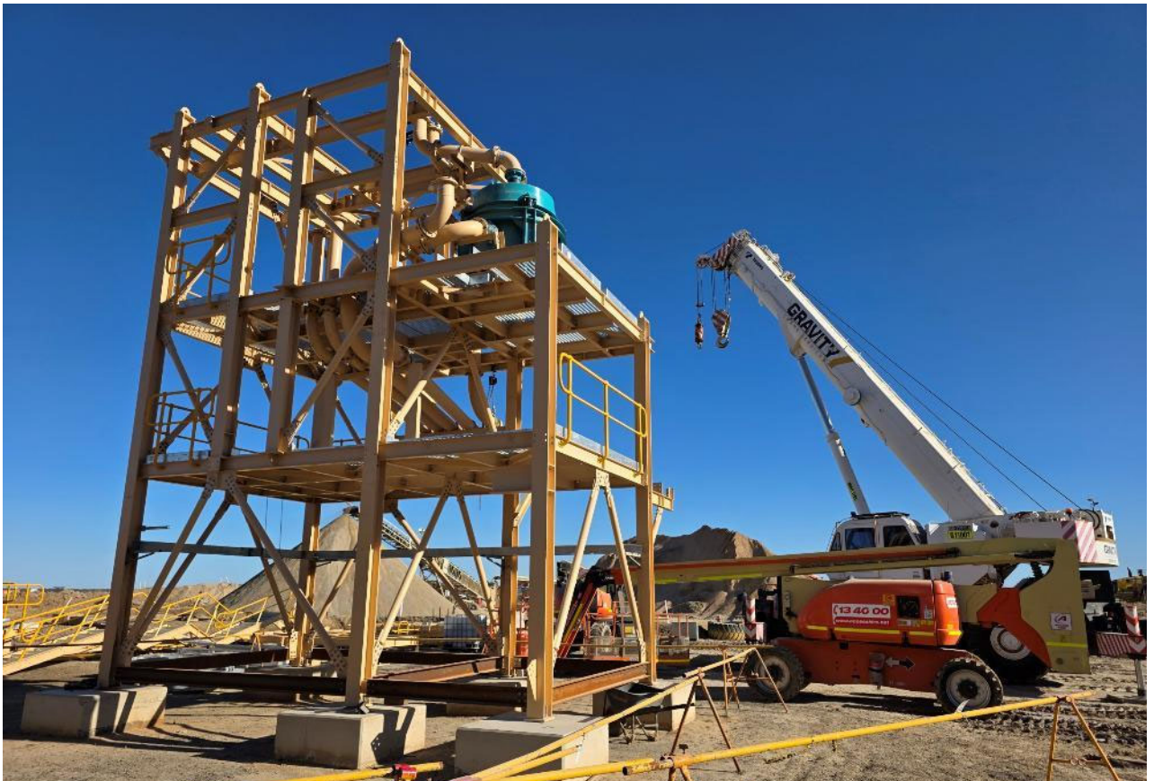
Figure 3: Fabrication of the gravity tower at Lakewood prior to installation; the structure also incorporated a new Knelson concentrator and screen deck.