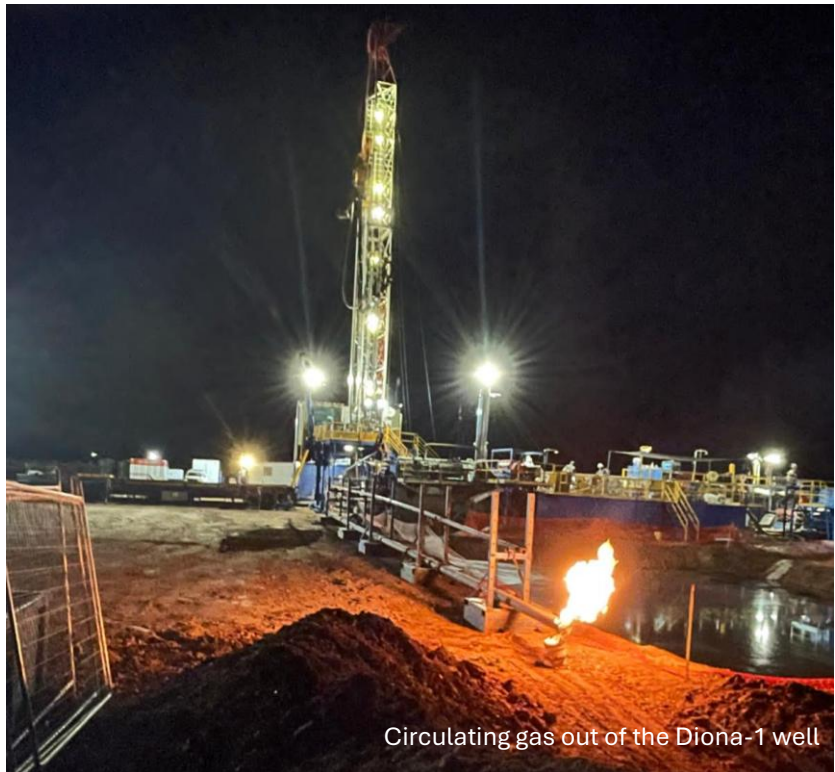
Circulating gas out of the Diona-1 well

Preliminary Logging While Drilling data indicates that several Permian-aged hydrocarbon bearing reservoirs are present within the Diona-1 well which warrant additional logging and testing. These preliminary observations bode well for the future potential of the well on acquisition of additional data. Drilling operations will complete followed by a wireline