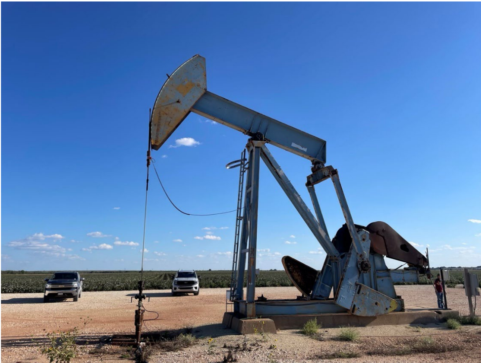
Photo 3. Existing JVU-6 production well at the Varn project.