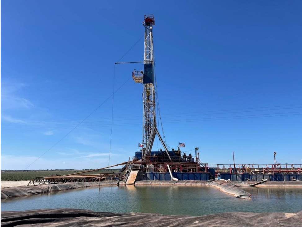
Photo 2. JVU-5 drill rig and lined pit.