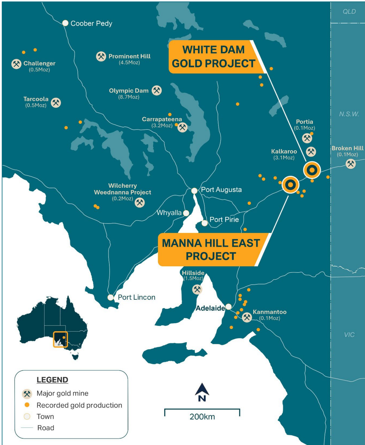
Figure 1; Location map of White Dam and Manna Hill project areas in South Australia