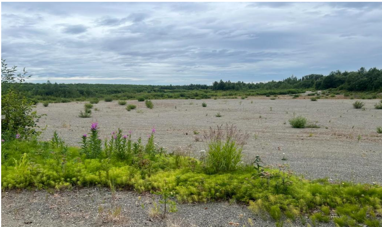
Figure 3. Photo of the proposed Port MacKenzie refinery site land area where Nova has obtained land use rights