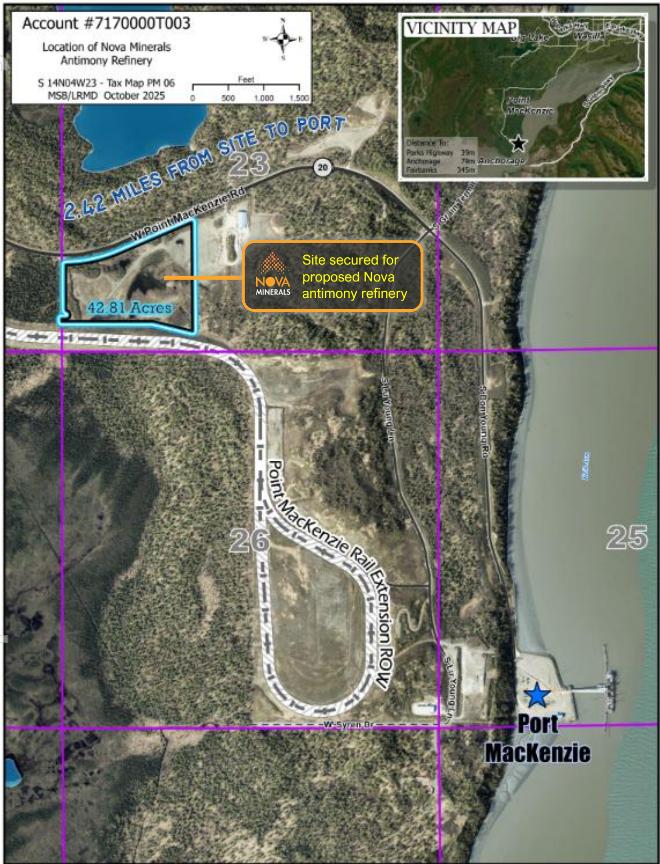
Figure 1. Aerial view of Port MacKenzie highlighting the site for Nova's proposed antimony refinery.