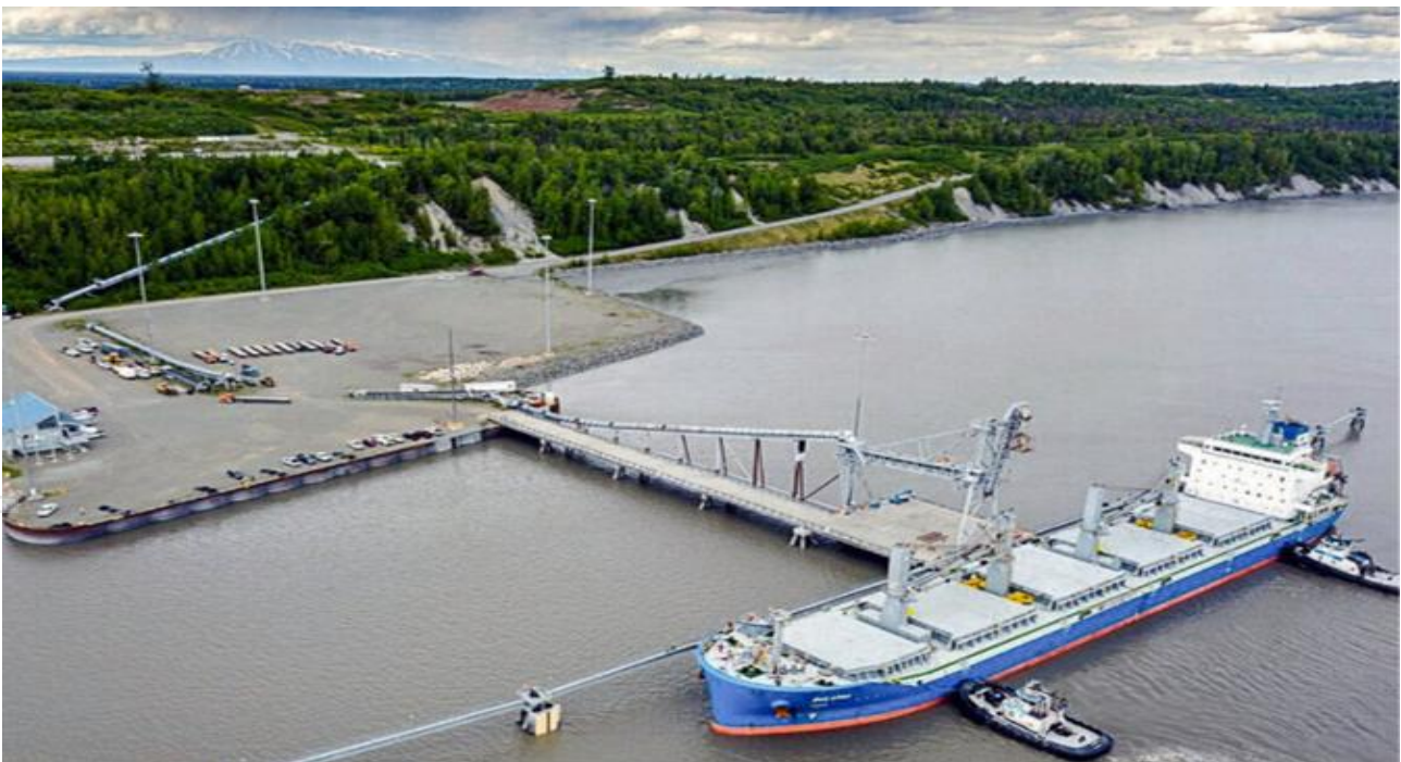
Figure 4. Photo showing the Port MacKenzie infrastructure

For more details on the Port MacKenzie operations please click here .