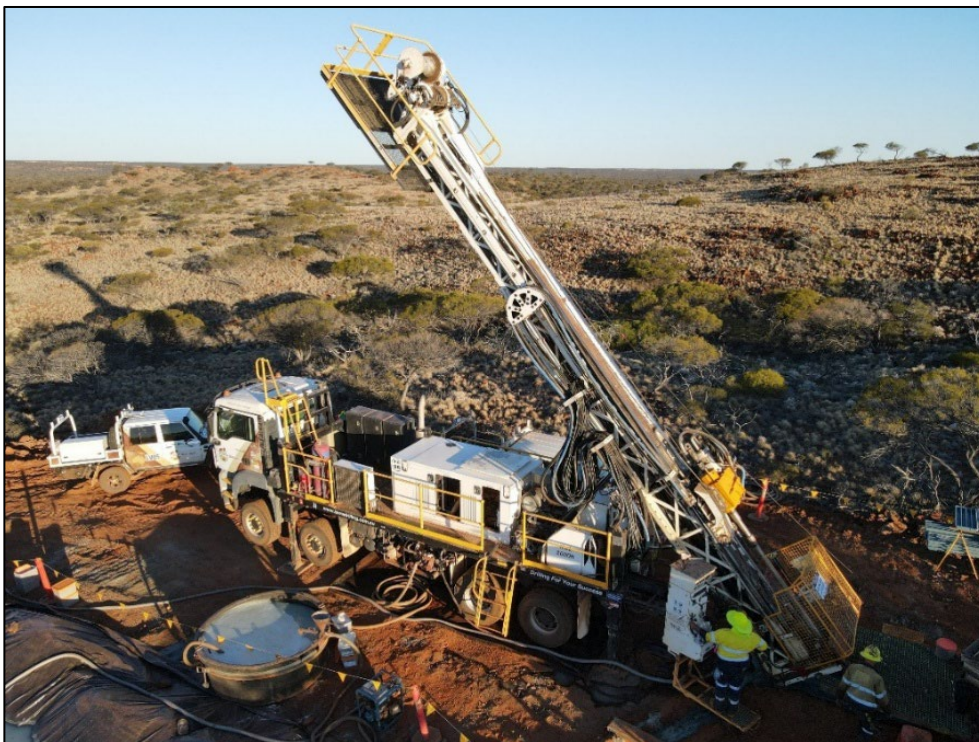
Figure 1. Terra Drilling diamond rig on site at Thylacine