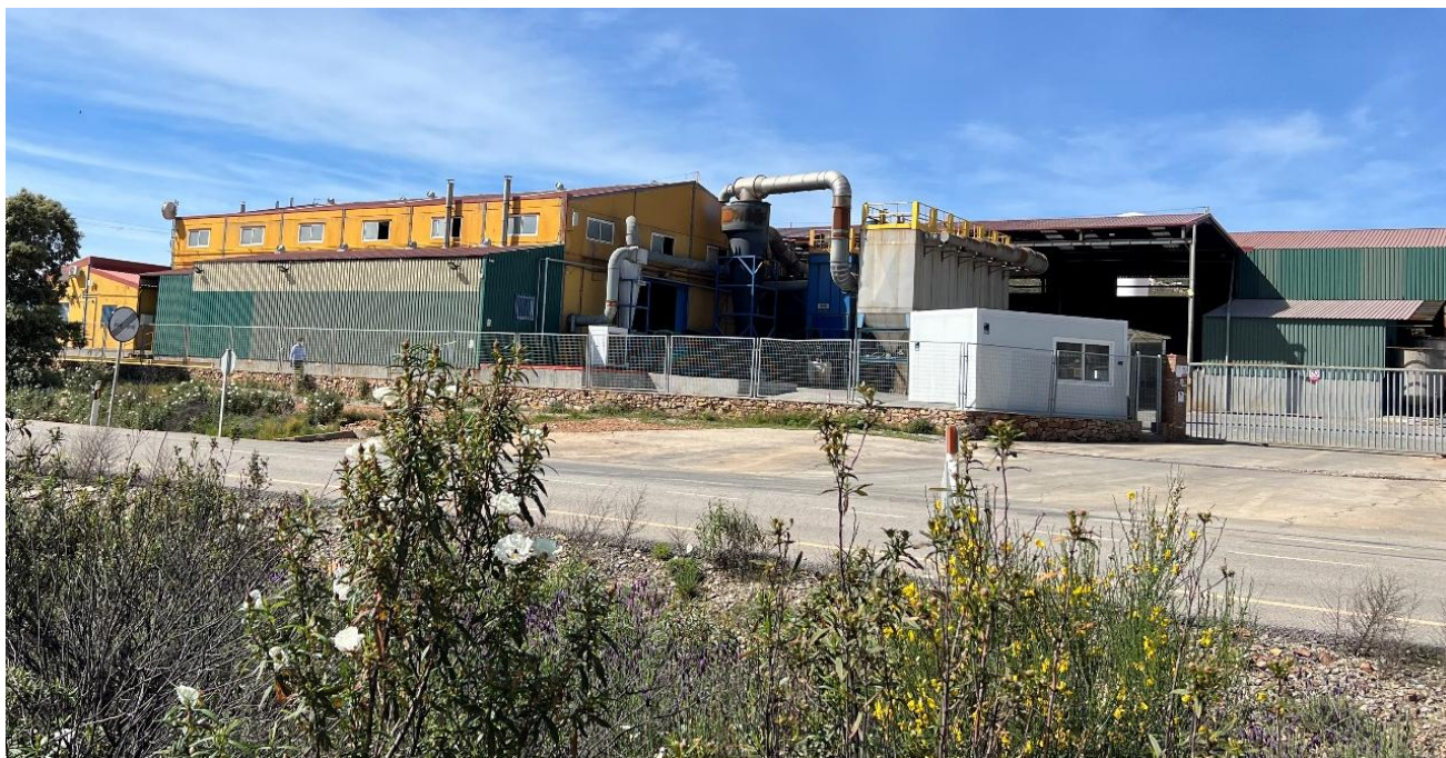
Figure 2 – Partial external view of Robledallano Smelter owners by Iberian Smelting SL

Elementos' Board has authorised the release of this announcement to the market.