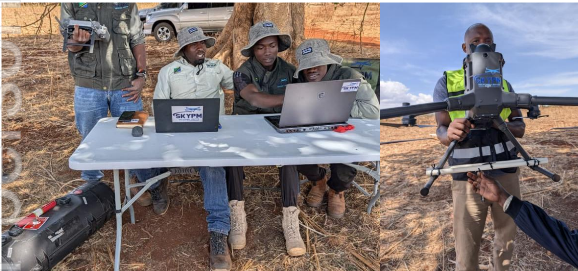
Figure 2 SkyPM Solutions Field Testing

This announcement has been approved for release by the Board.