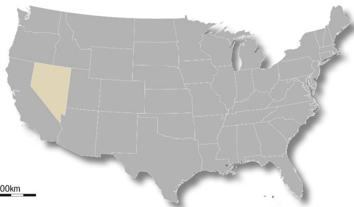
Figure 1. Shows the scale comparison between the Arabian-Nubian Shield and SNX's current exploration focus of Nevada, USA.