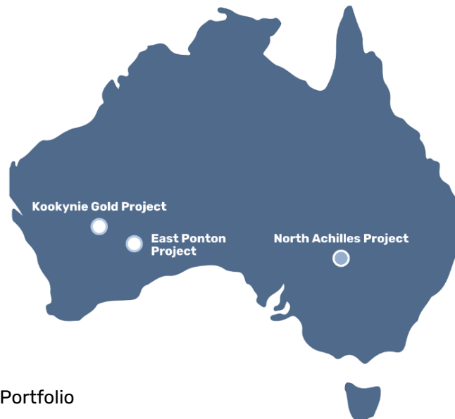
Figure A: Regener8 Exploration Portfolio Project Locations

The Company confirms that all material assumptions and technical parameters underpinning the exploration results in this report continue to apply and have not materially changed. The Company is not aware of any new information or data that materially affects the information included in this release.