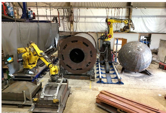
Image of Robotic Arms for Material Handling and Laser welding, including jigs, partially complete cylinder section and end cap.

Further resources will be added to the operations team during the December 2025 quarter, with progress updates provided in the Company's Quarterly Reports and as key milestones are achieved.