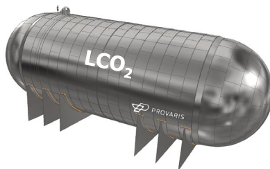
Illustration: Provaris' 25,000 bcm LCO 2 Low Pressure Tank designed for Yinson's 100,000 bcm FSIU

The FEED stage for the LCO 2 tank project, integrated with Yinson's Floating Storage and Injection Unit (FSIU), covers the design of test sections for Provaris' proprietary tank. With design and testing protocols ongoing, planning will begin for fabricating tank sections at Provaris' Innovation Centre, using the established material handling and laser welding technology. More details will be available in December 2025.