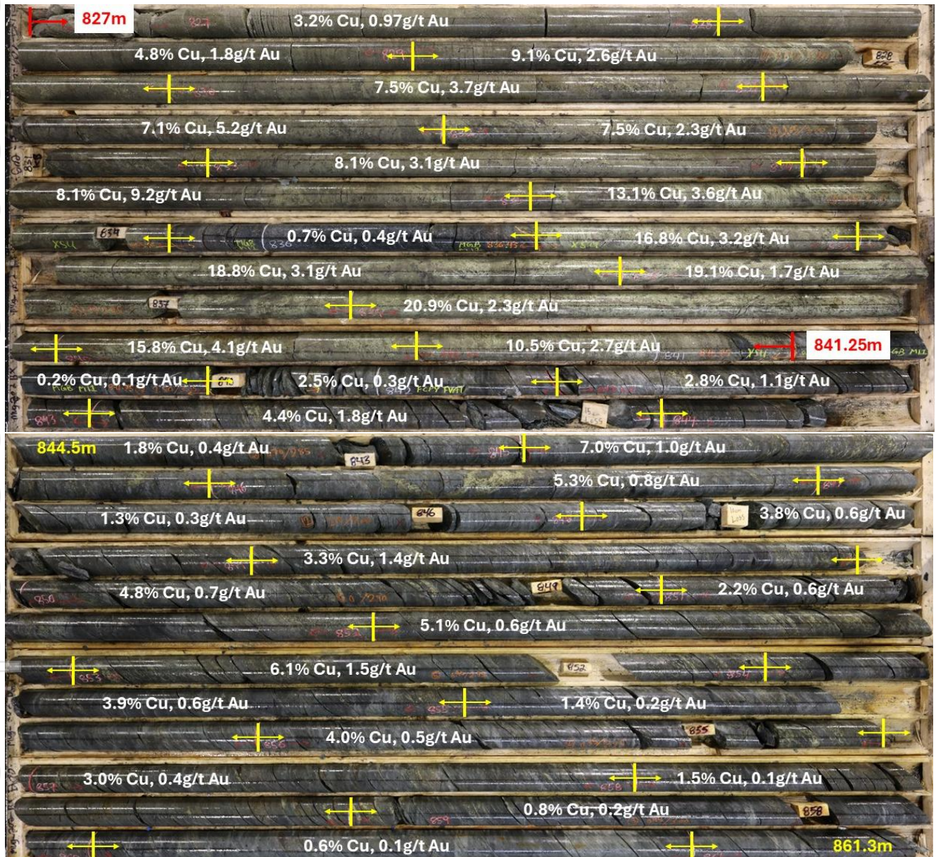
Figure 2: Core photographs for drillhole MUG25-202, showing the upper VMS (827m-841.25m) that grades 14.3m @ 13.7% CuEq and the adjacent broad FWZ stringer-style mineralisation. This is part of the broader step-out intersection of 49.0m @ 6.1% CuEq.