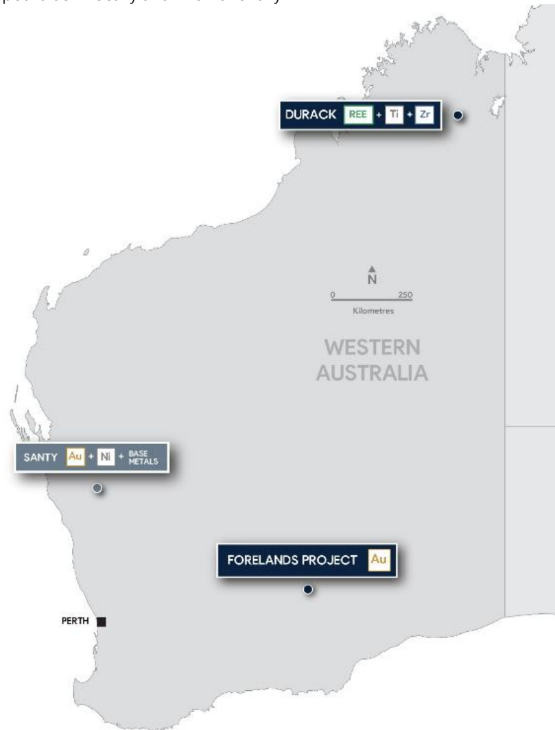
BPM Minerals Western Australian Project

The management and exploration teams are well supported by an experienced Board of Directors who have a strong record of funding and undertaking exploration activities which have resulted in the discovery of globally significant deposits both locally and internationally.