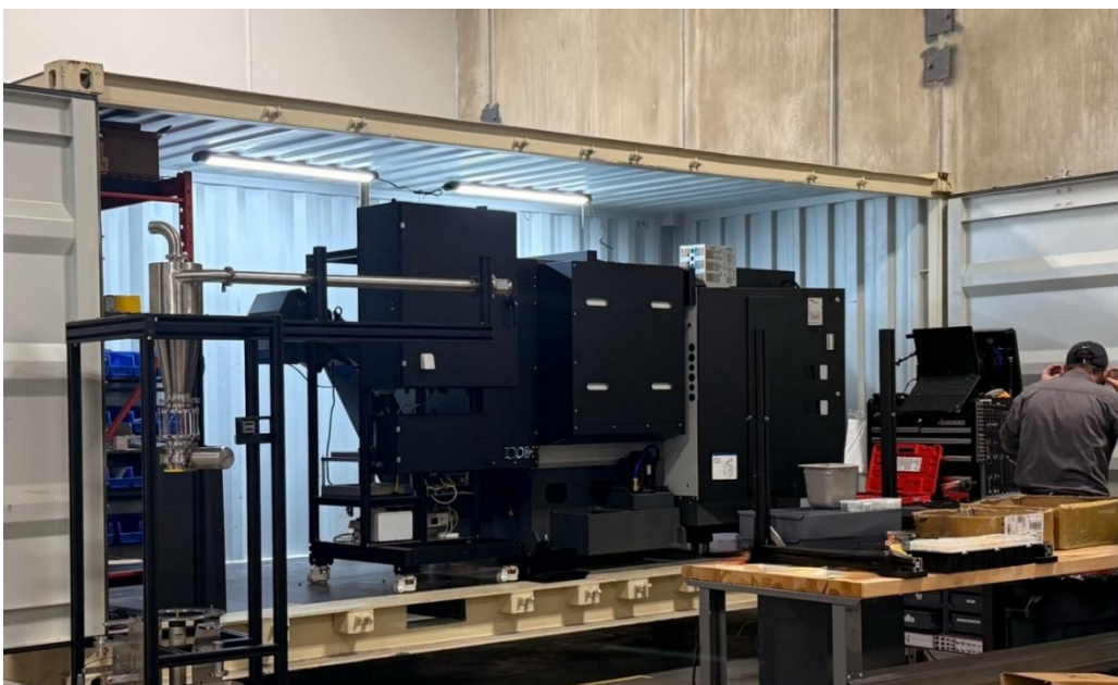
Figure 0-1 MPW readies the US Navy Expeditionary DirectPowder(TM) Unit

The mobile containerised system enables rapid, on-site production of high-quality powders in remote or contested environments, resulting in MPW powders developing new or existing applications. The expeditionary unit complements MPW's Neighbourhood 91 facility, with the mobile unit addressing urgent, field-based needs while N91 continues to supply high-volume, multi-material production . This engagement embeds MPW in ongoing Navy exercises, strengthens its position as first-choice powder supplier and provides early-mover advantage in defence additive manufacturing.